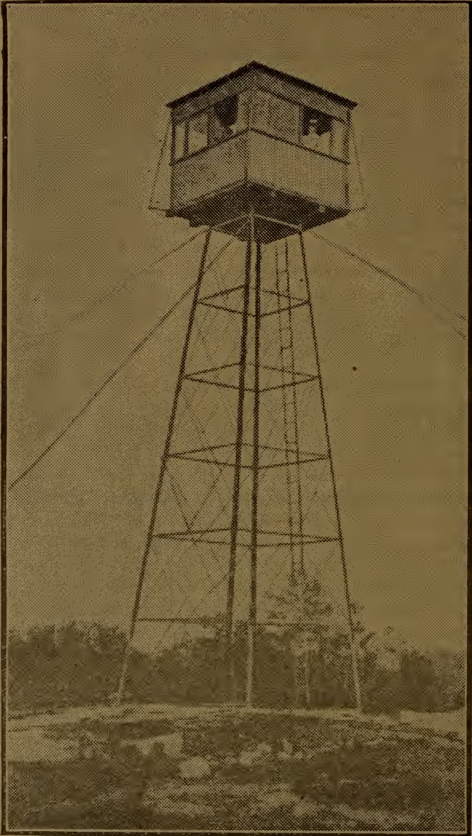
ROBINS HILL OBSERVATORY

Most of the towns in northern Middlesex benefitted by the tower contributed to the cost of erection. Chelmsford bore the