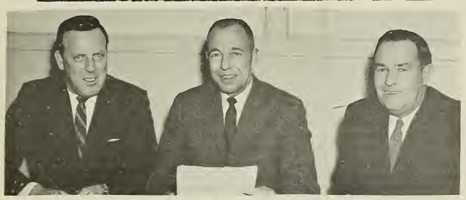
REPORT OF THE BOARD OF SELECTMEN