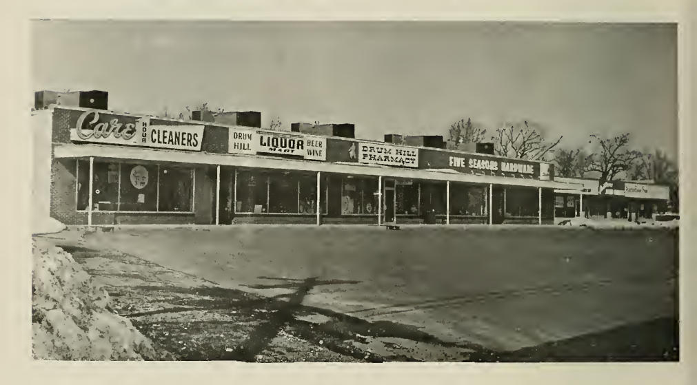
Stores located at Drum Hill Shopping Center