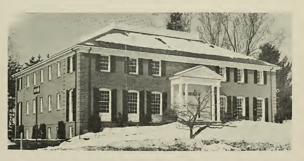
The Chelmsford Center Professional Building. North Road