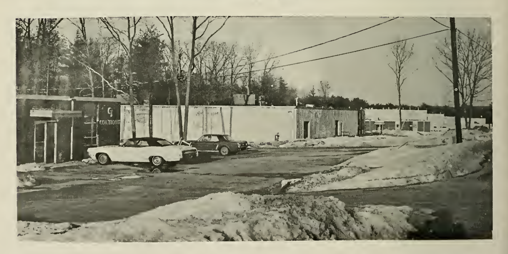
Various Industrial Buildings located at Alpha Park.