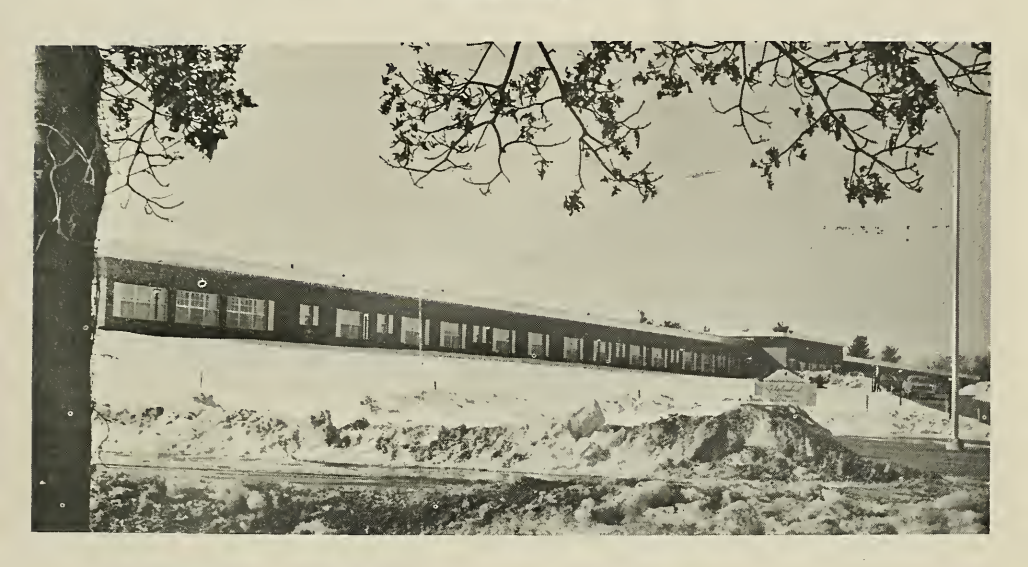
Chelmsford House Nursing Home Parkhurst Road,