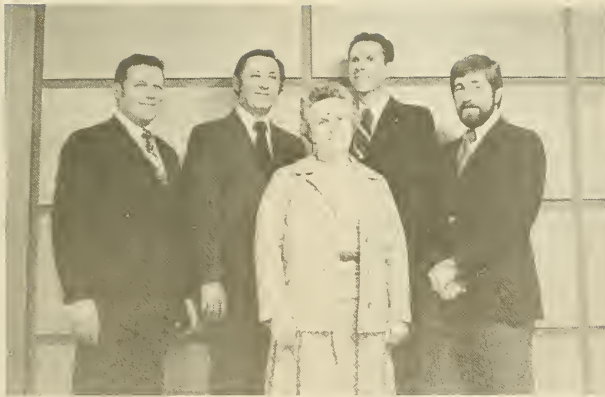
The members of THE SCHOOL COMMITTEE