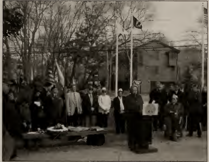
Congresswoman Niki Tsongas, Veteran's Day 2008

Federal VA benefits can have a more significant impact for the veteran and the community. The number of veterans eligible for Federal VA benefits is always a small percentage of the total number of veterans in the community. Almost all VA benefits must be applied for – they are not automatic. This office helps any Chelmsford veteran dealing with the VA claims process. The claims may be an initial filing, reopen a disability claim for increase, appeals on denied claims, hearings with the Regional Office or hearings before the Board of Veterans Appeals. The VA periodically takes a 'snapshot' of the total amount of Federal Veterans benefits that flow into a community. The latest figures are from 12/2008. The amount of Federal VA money that flows annually into Chelmsford is $3,961,228.00 as disbursed to 364 Veterans and 58 widows/ surviving family members living in Chelmsford.