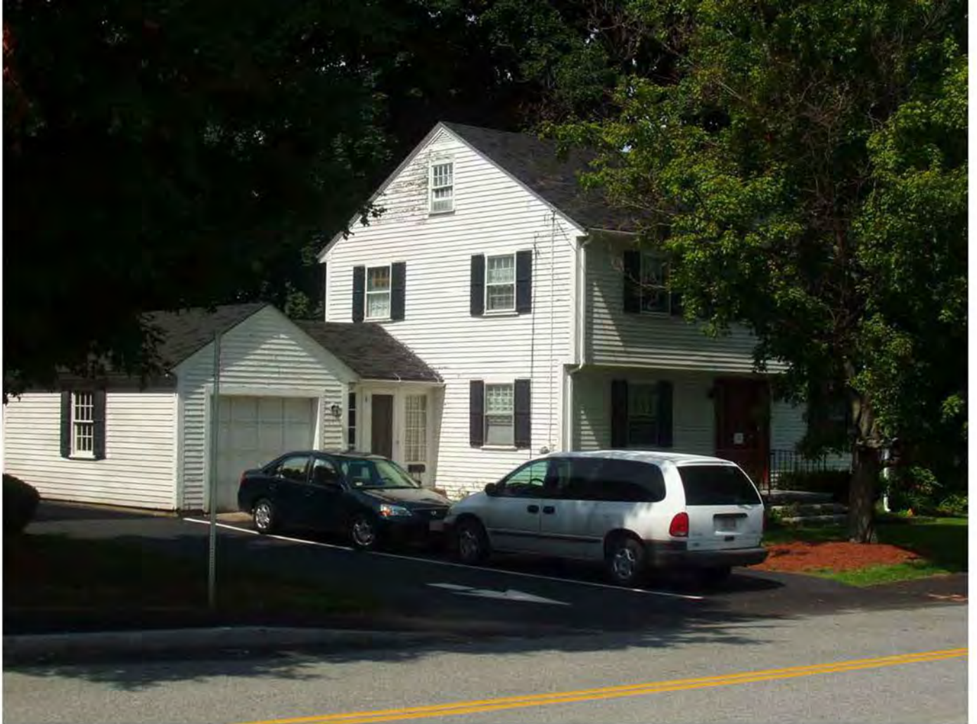
'Baptist Parsonage' 7 Academy Street