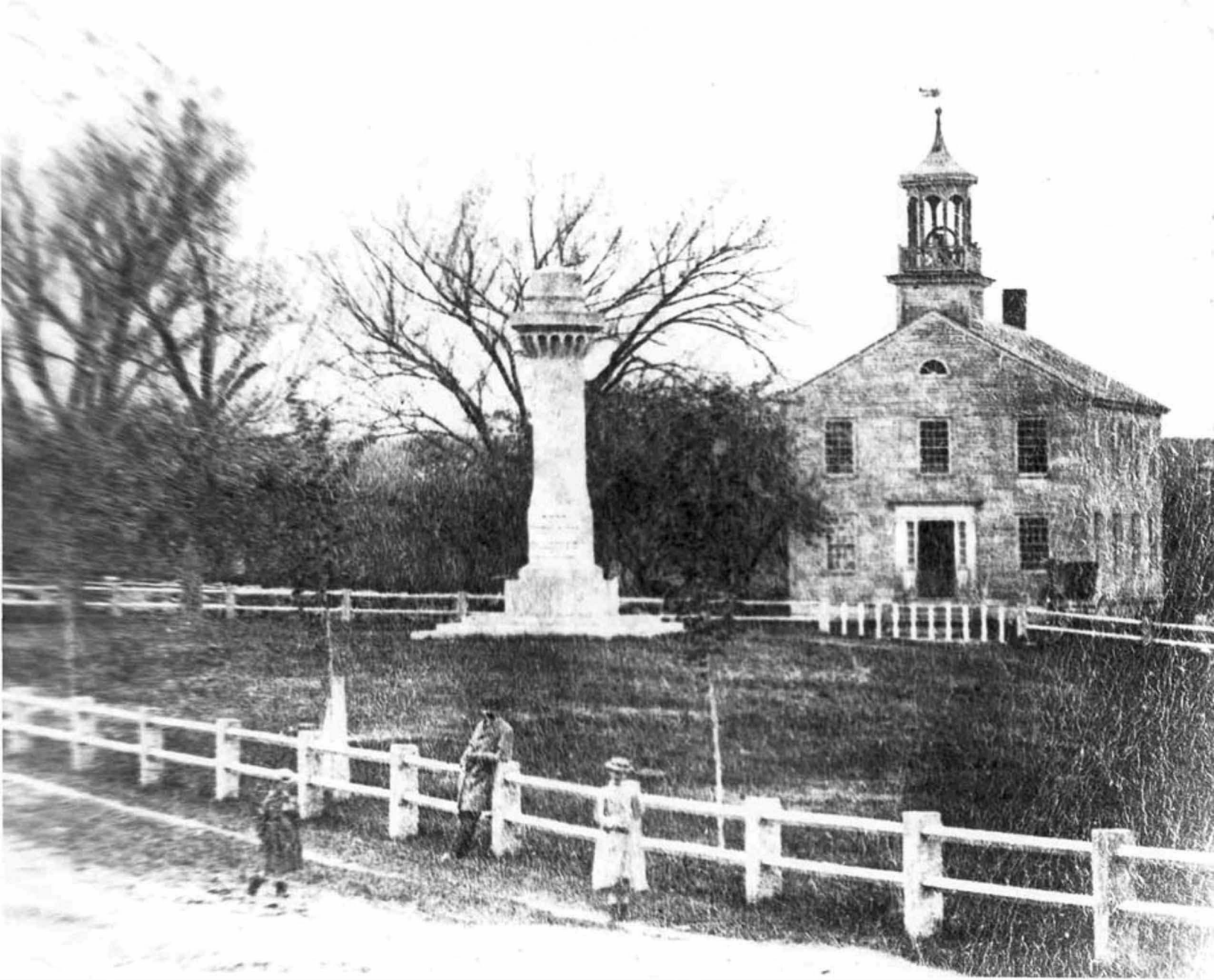
7 Academy Street, Chelmsford Classical School, on or before 1866