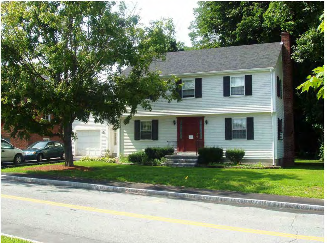
7/25/2004 F Merriam