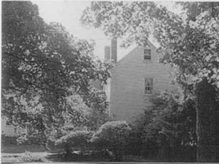
North side of main house