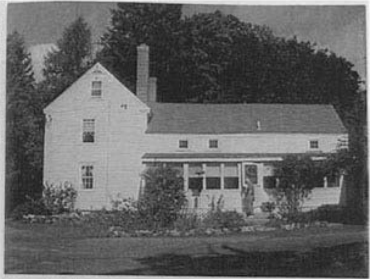
South side main house + kitchen ell