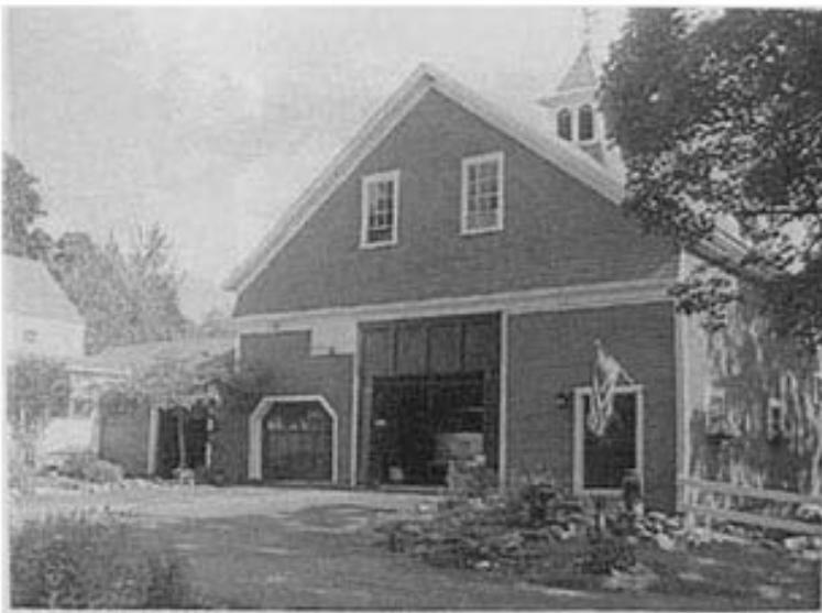
kitchen ell + east side barn