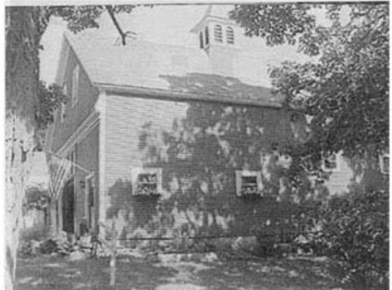
South side of barn