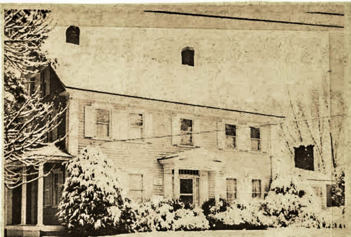
The Former Sidney Dupes house, now the home of Dale Carlisle, 246 Acton Road.