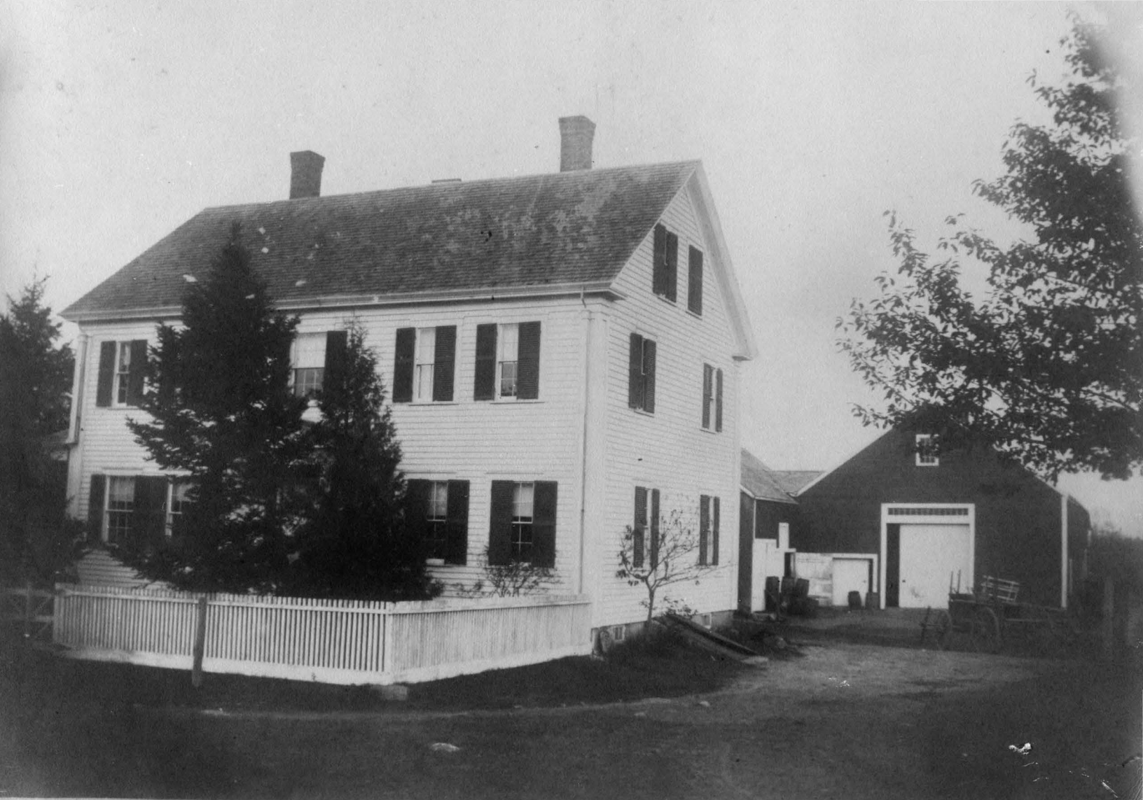
246 Acton Road c 1900