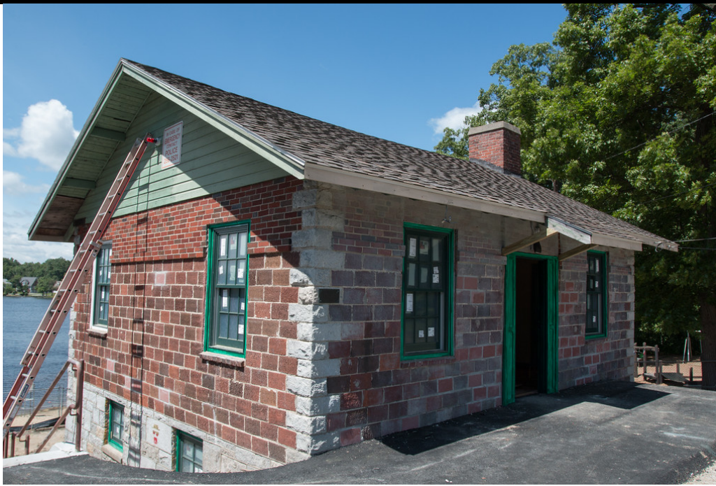
Field house building, facing west. Photograph taken by Fred Merriam, Chelmsford Historical Society, June 2016.