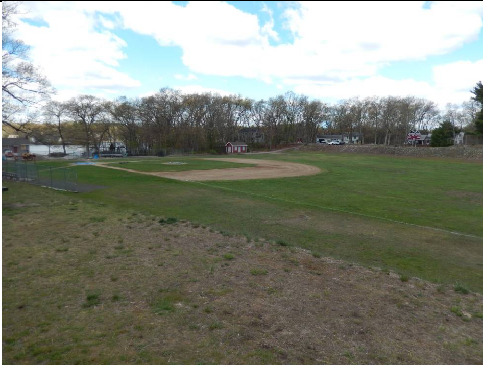
Baseball field, facing southwest. May 2016.