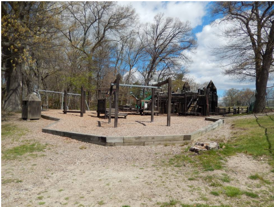
Playground equipment, facing northeast. May 2016.