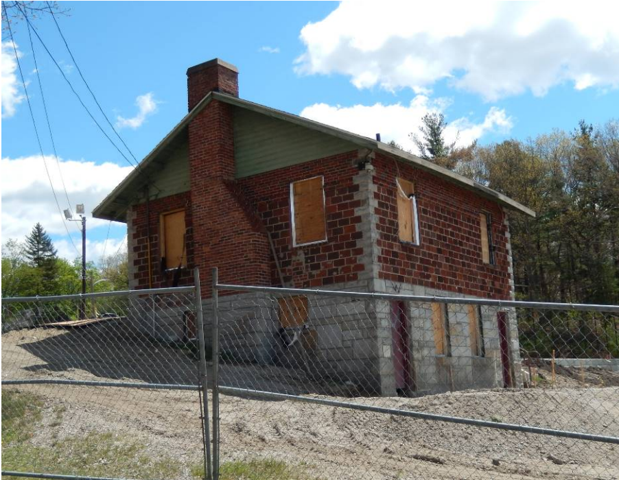
Rear of field house, facing southeast. May 2016.

Genealogical research, including U.S. and Massachusetts census records; birth, marriage, and death records; and city directory records from ancestry.com.