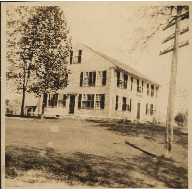
Undated photograph of Town Farm house.