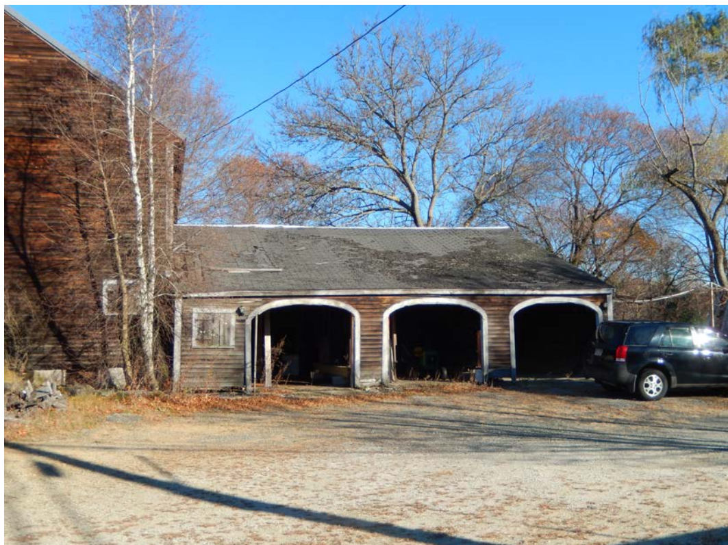
Shed wing of barn, facing east. November 2015.