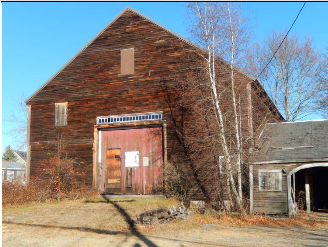
Barn, facing east. November 2015.