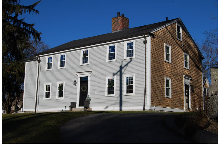
View looking northeast from Boston Road.