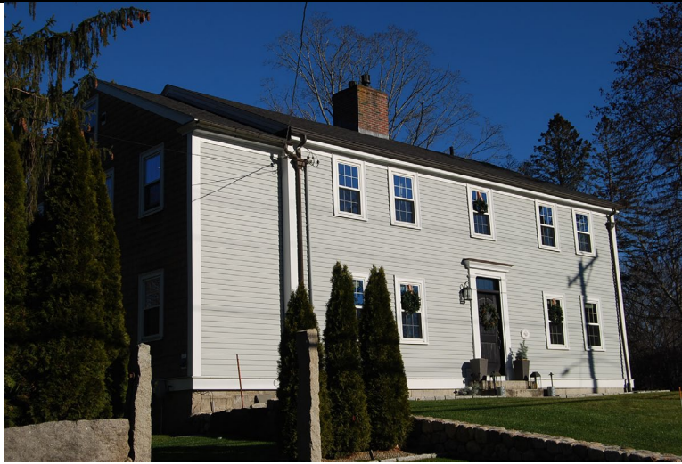
View looking southeast.