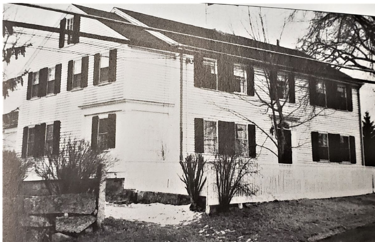
Historic image. View looking southeast.