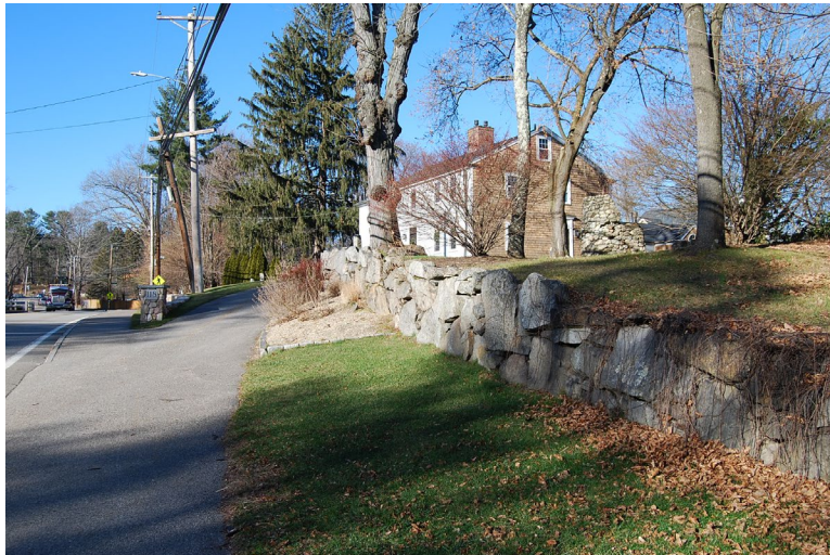
View looking north.