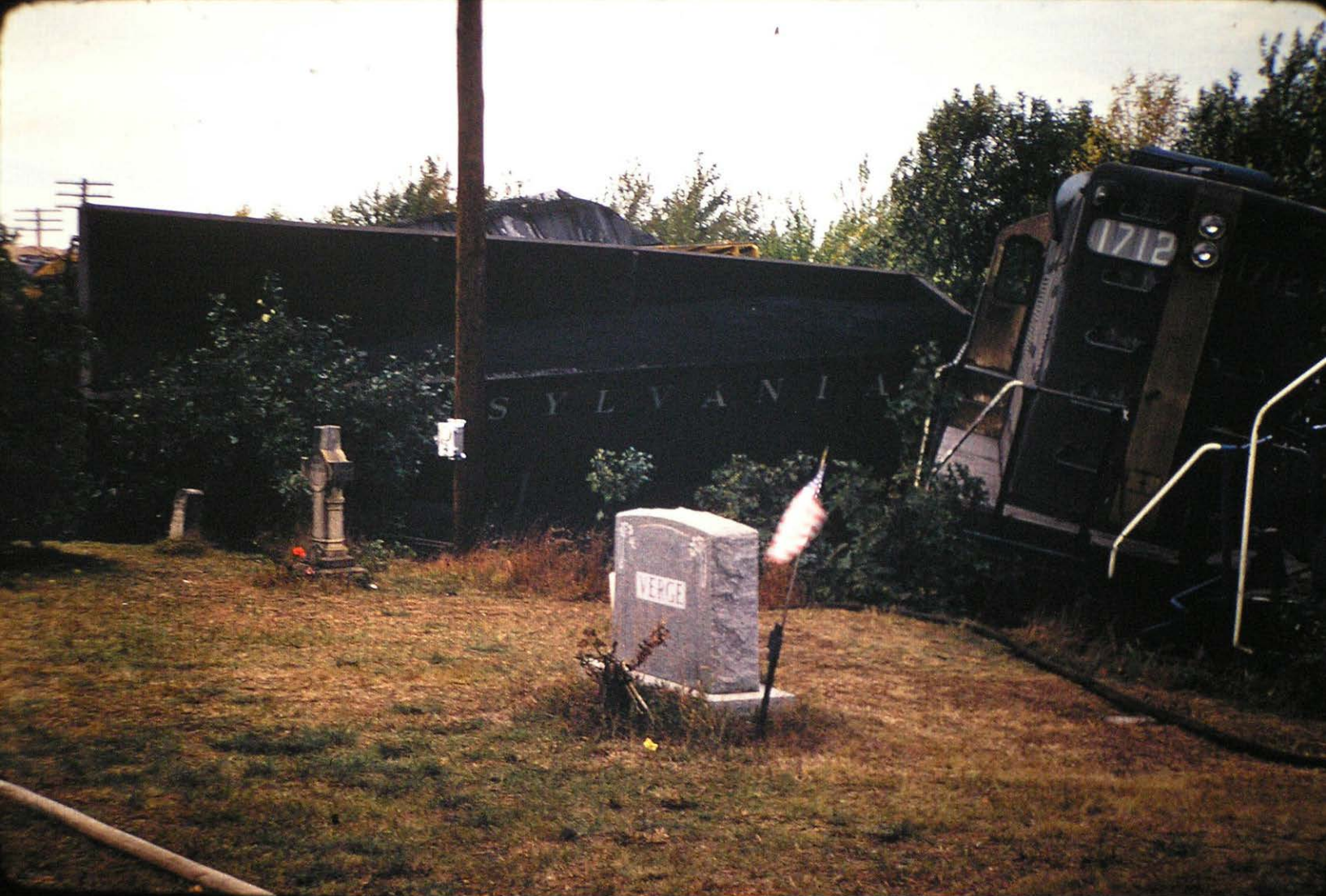
Riverside Cemetery B&M Train Wreck