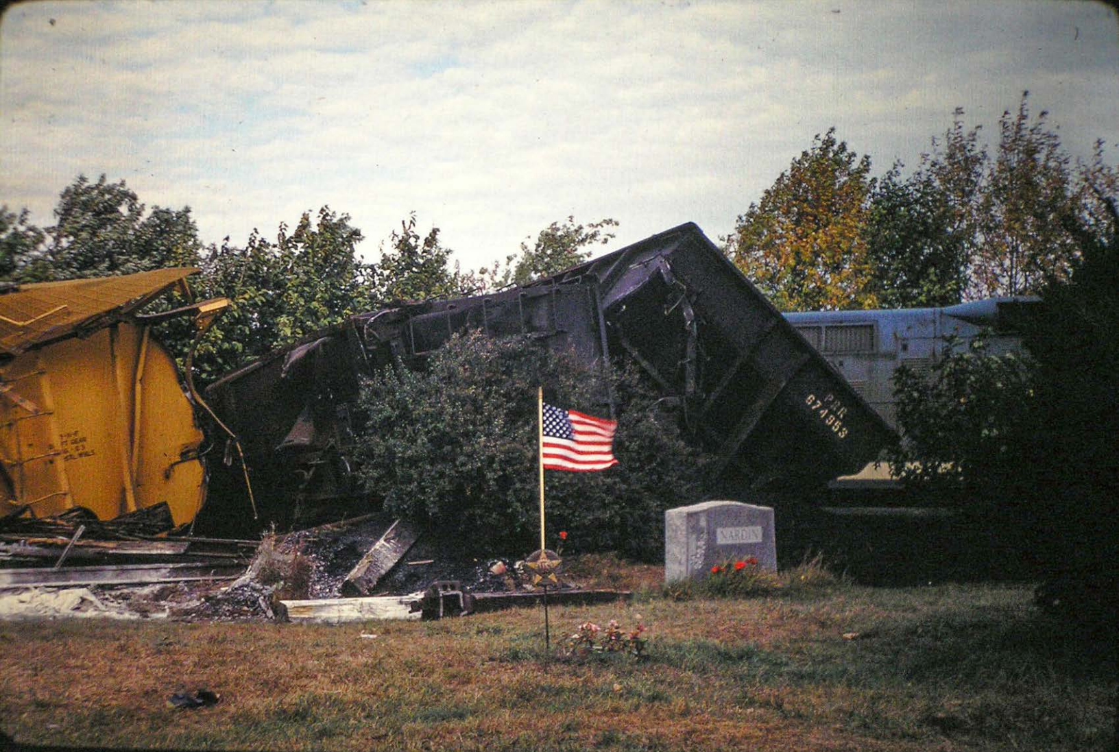
Riverside Cemetery B&M Train Wreck