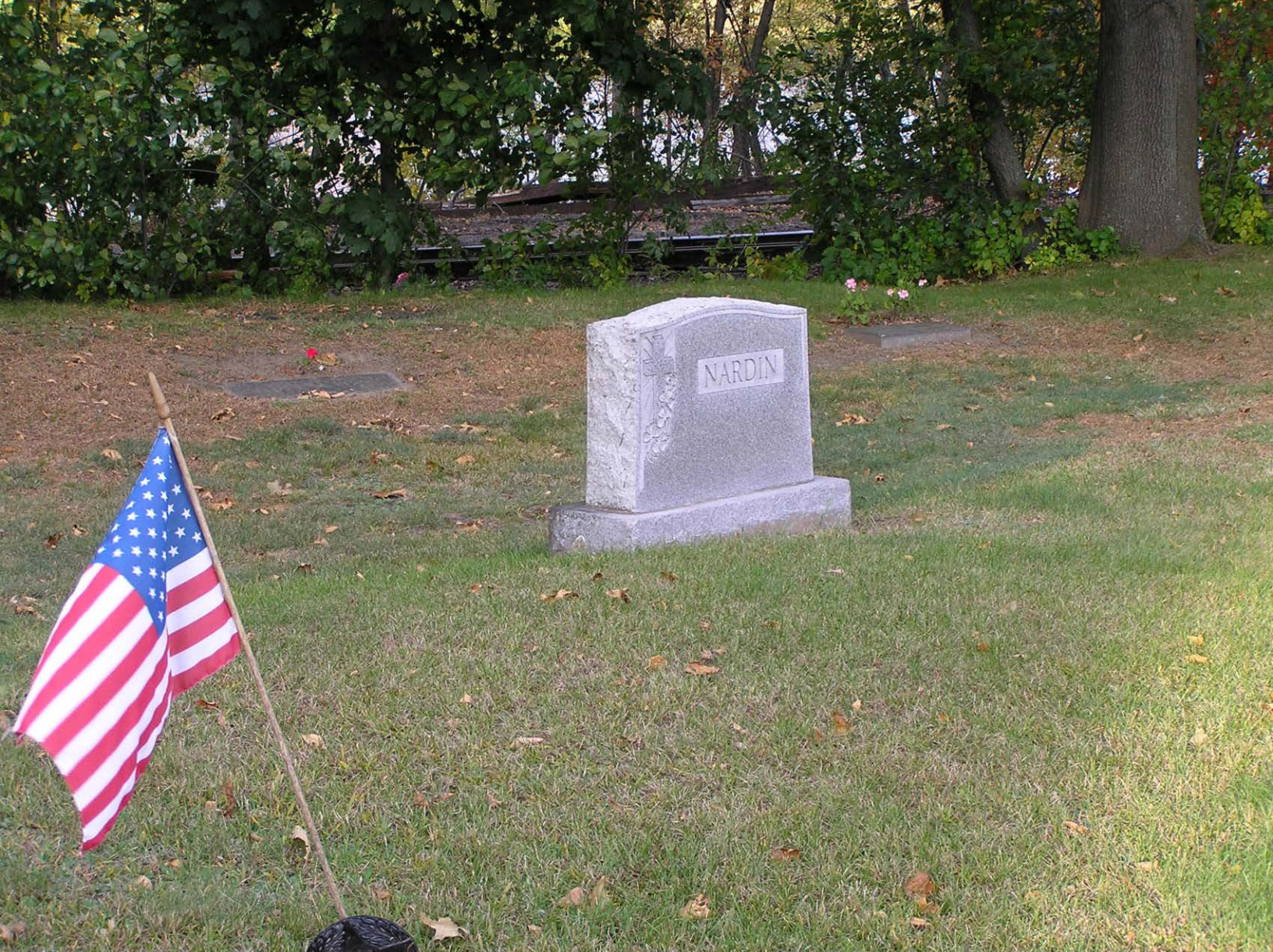
Riverside Cemetery today