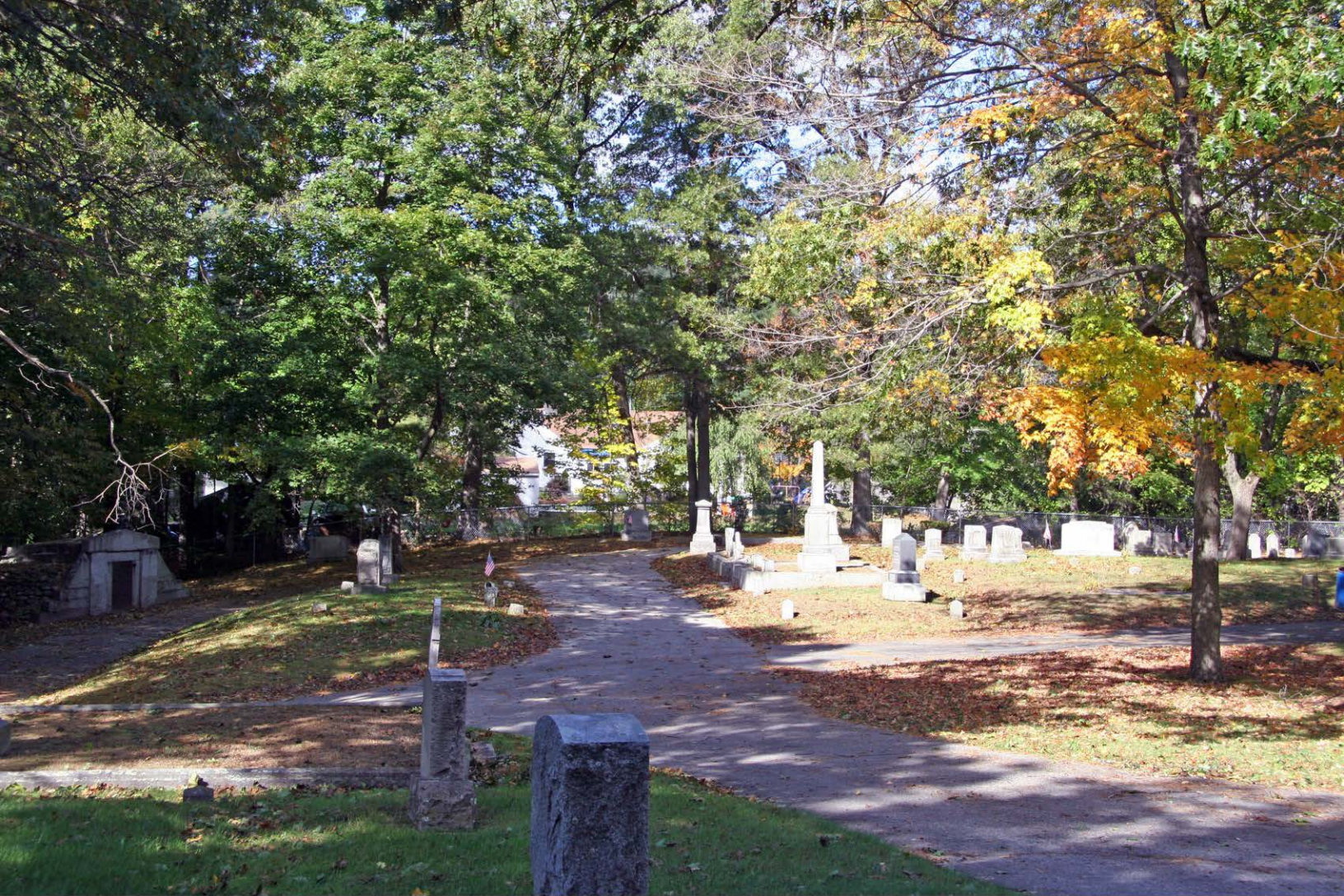
West Chelmsford Cemetery