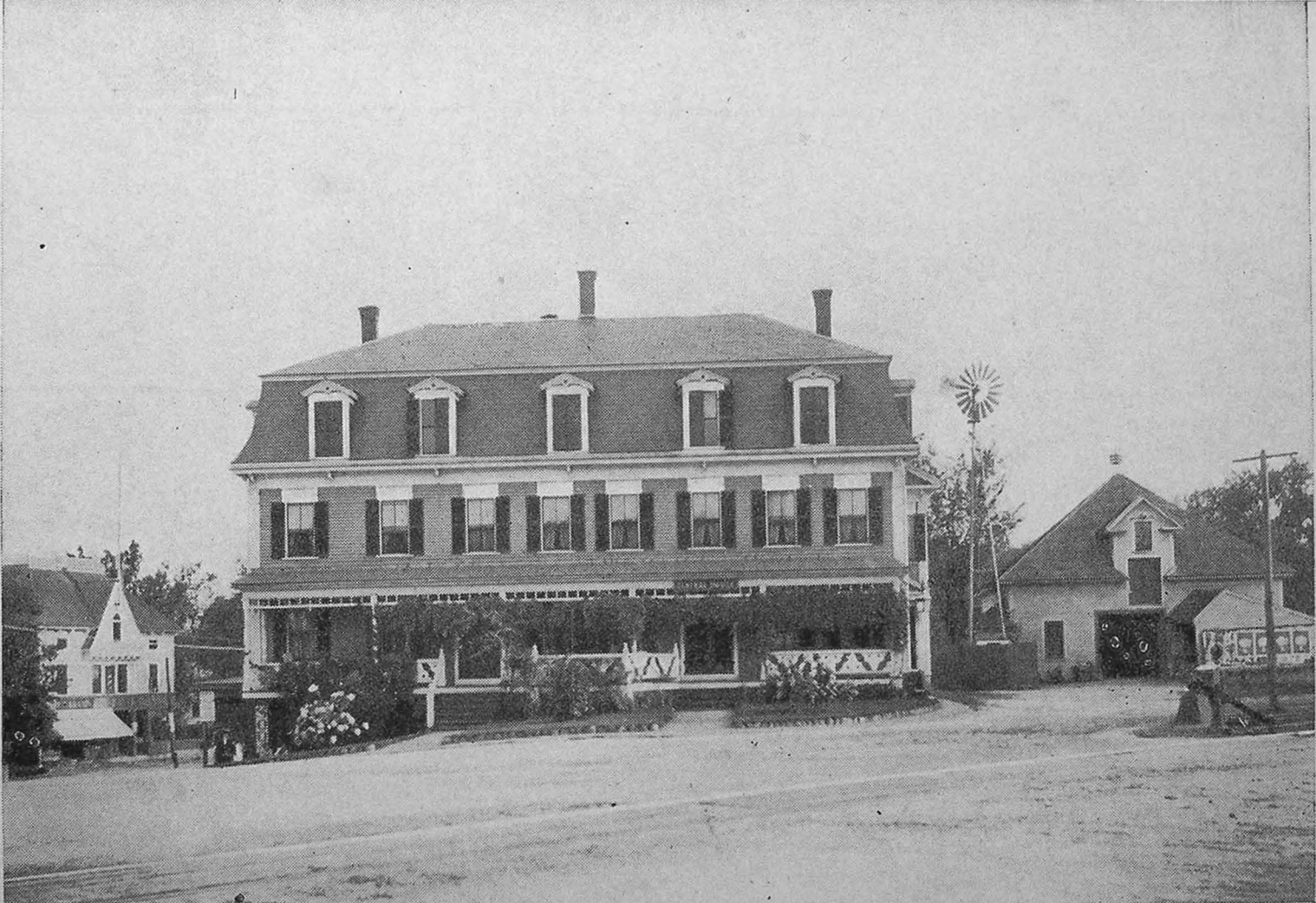
CENTRAL HOUSE, CHELMSFORD, MASS.