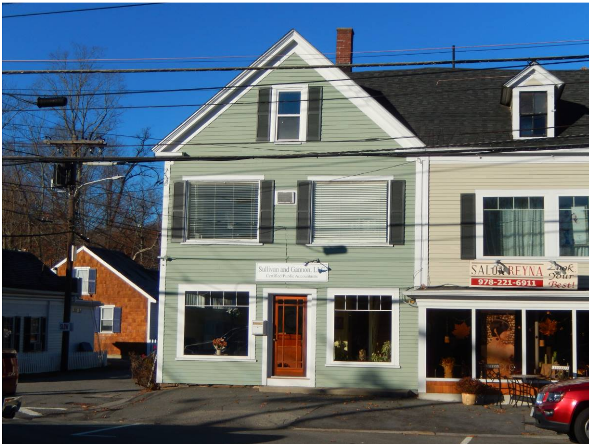
22 Central Square, facing west. November 2015.