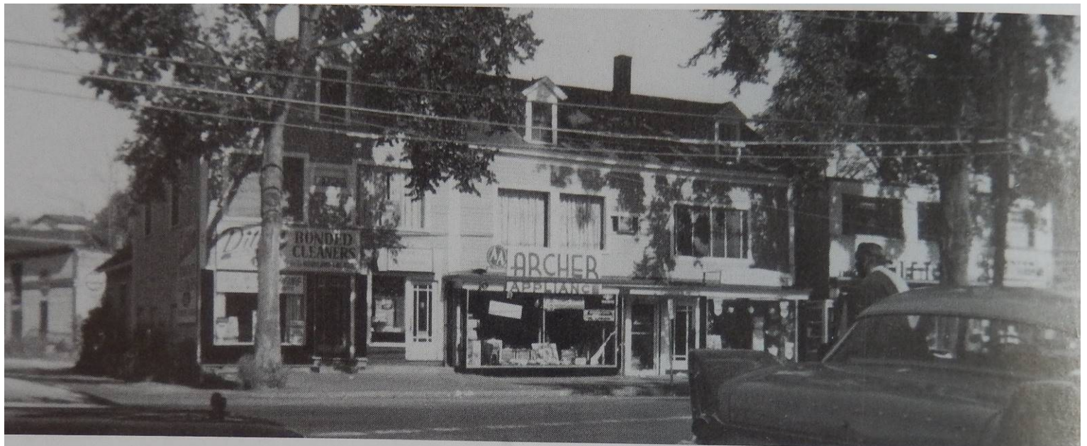
Ca. 1959 photograph of 19 and 22 Central Square.