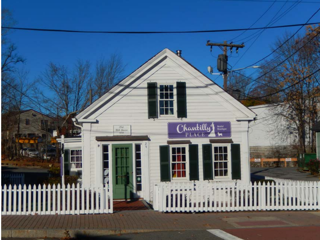
24 Central Square, primary façade, facing west. November 2015.