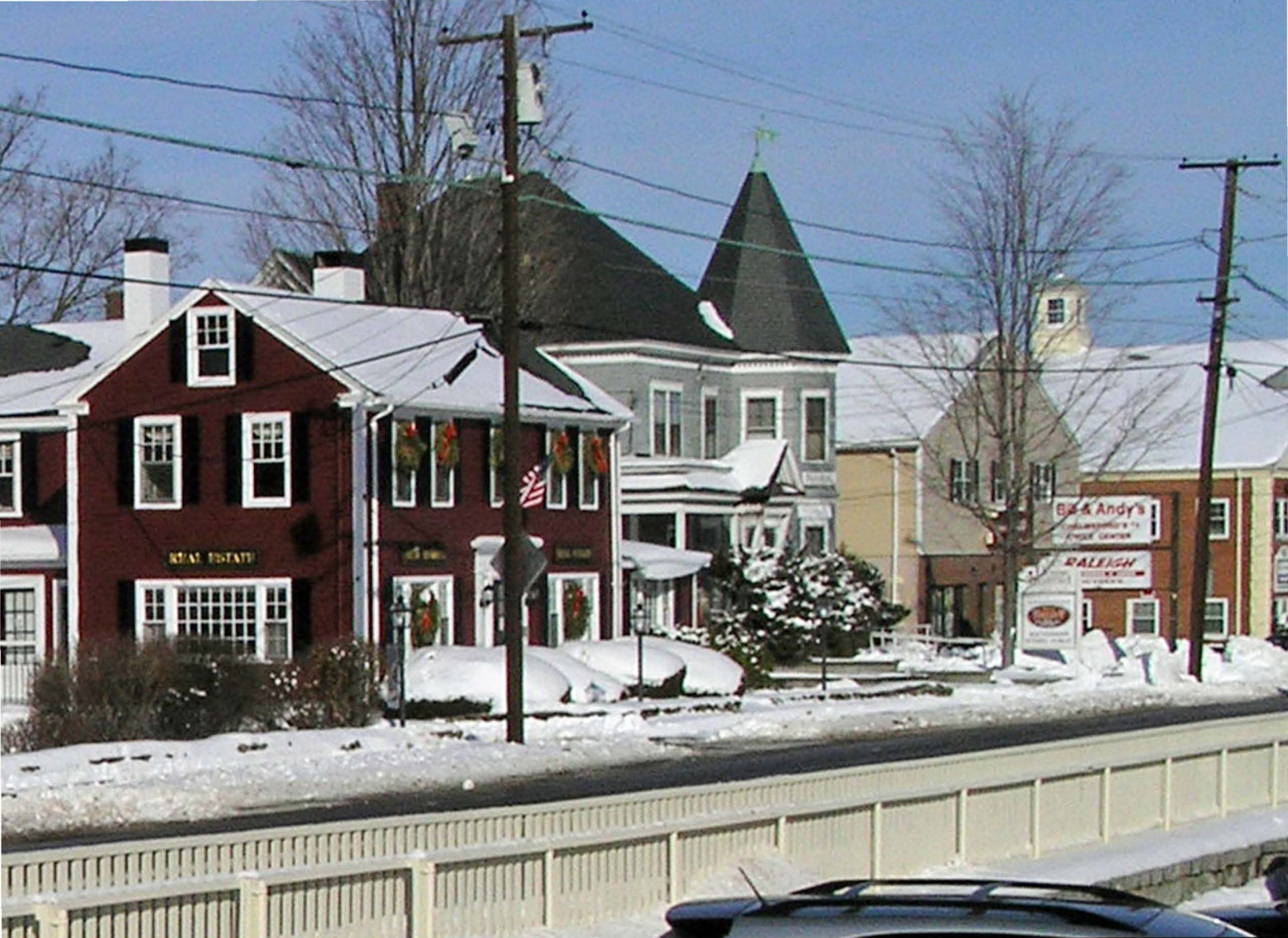
12/28/2004 F. Merriam