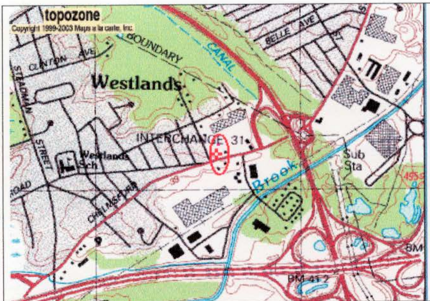
Topozone excerpt from Billerica USGS quadrangle.

Decimal coordinates as provided by Topozone: 42°36'44" W 71°20'01" N