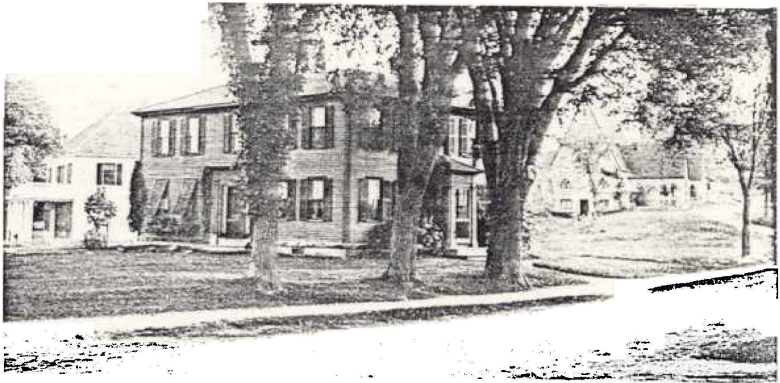
ALL SAINTS PARSONAGE - This familiar town landmark was built in 1767. It was moved from its original location on the old turnpike (now Turnpike Road) near Billerica Street, to its present location on the corner of Billerica and Chelmsford Streets, in 1810.

Chelmsford Newsweekly 1965 Note 9-11 Chelmsford Street to left of Parsonage