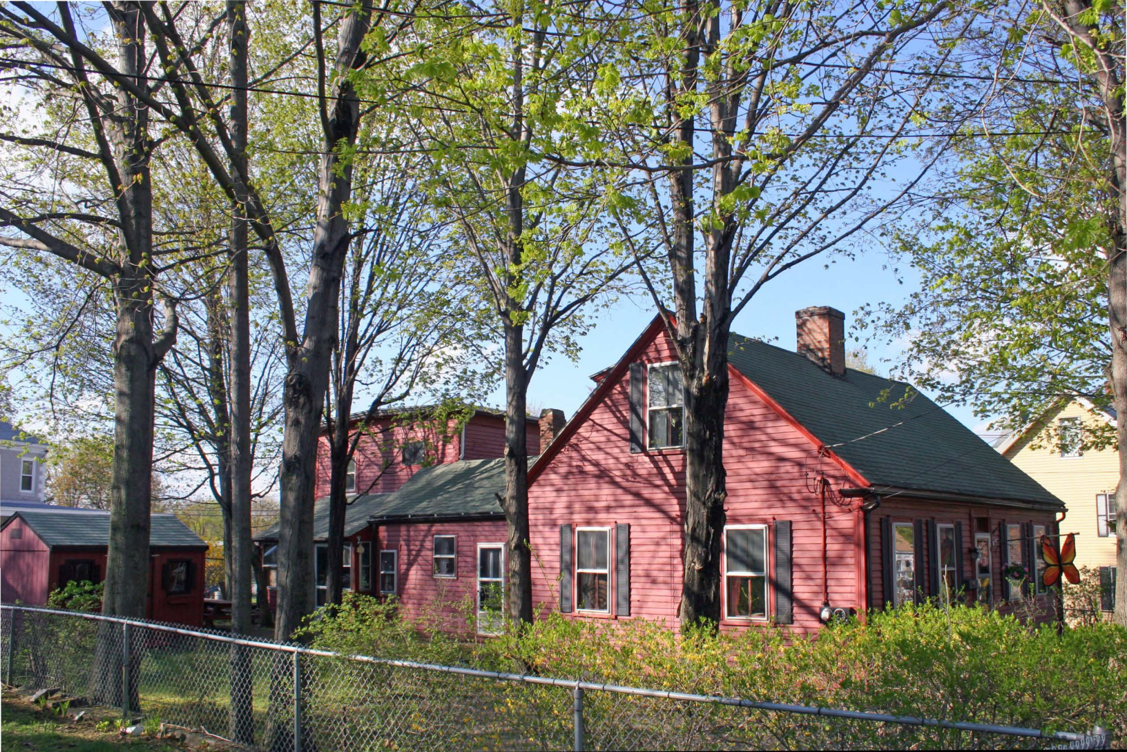
Cottage Row #7