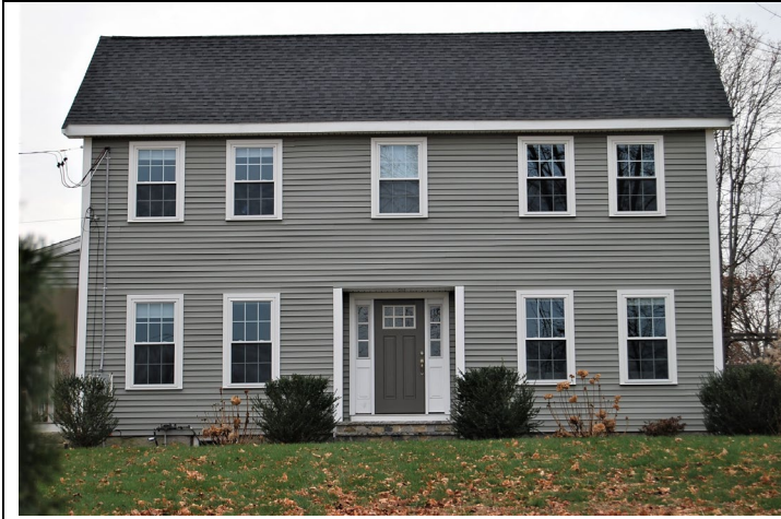
View looking west from North Road.