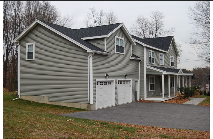
View looking northeast from Davis Road.