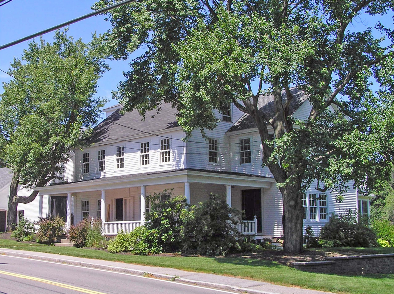
21 Davis Road