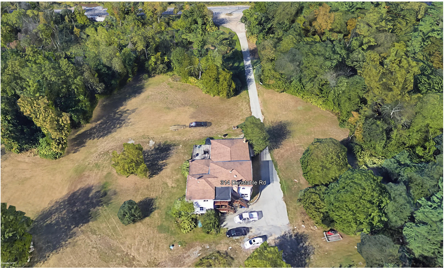
From Google Earth, 2021, before demolition