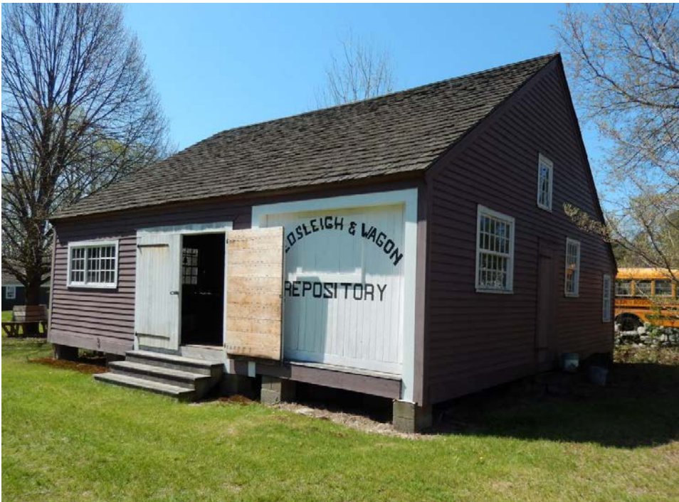
Byam Blacksmith Shop, CLM.337, facing west. May 2016.