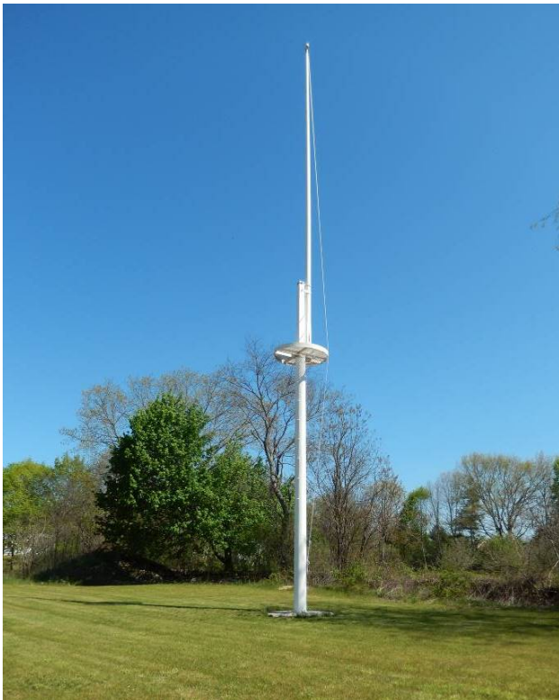
Flag pole, CLM.972, facing north. May 2016.