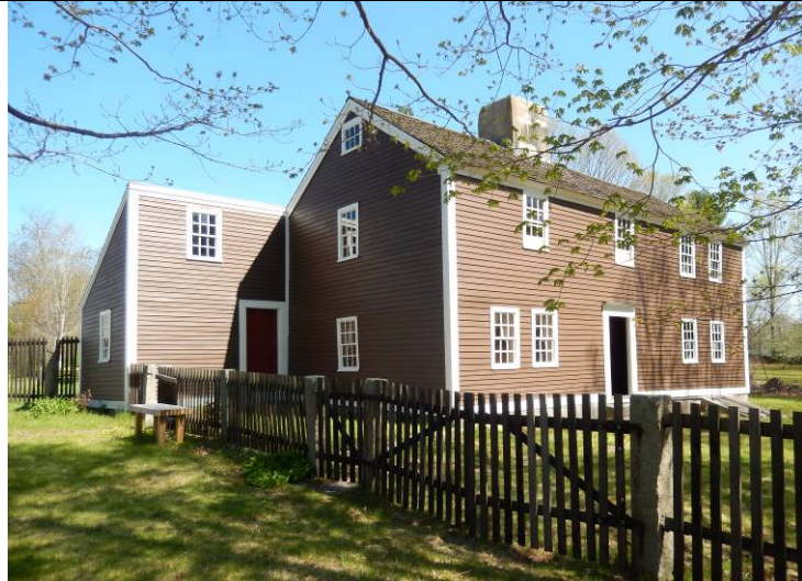
Garrison House, CLM.100. May 2016.