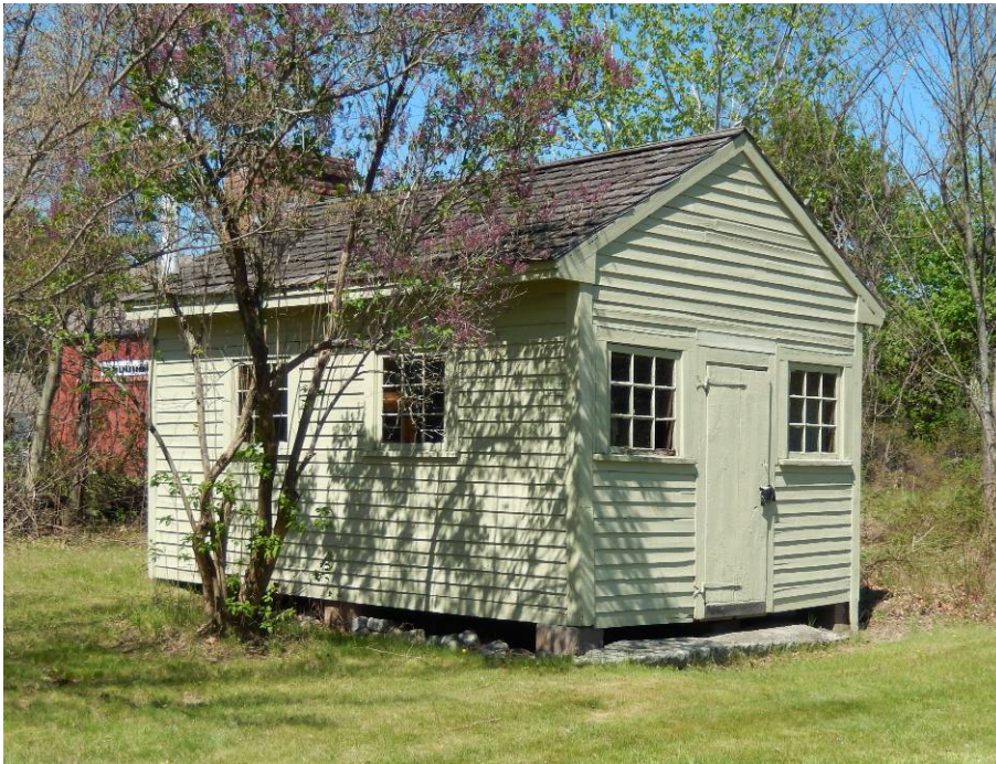
Summer kitchen, CLM.341, facing northwest. May 2016.