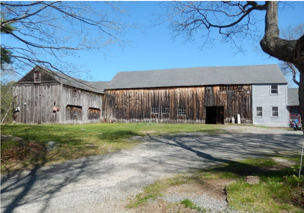
Garrison House Barn, CLM.340, facing north. May 2016.