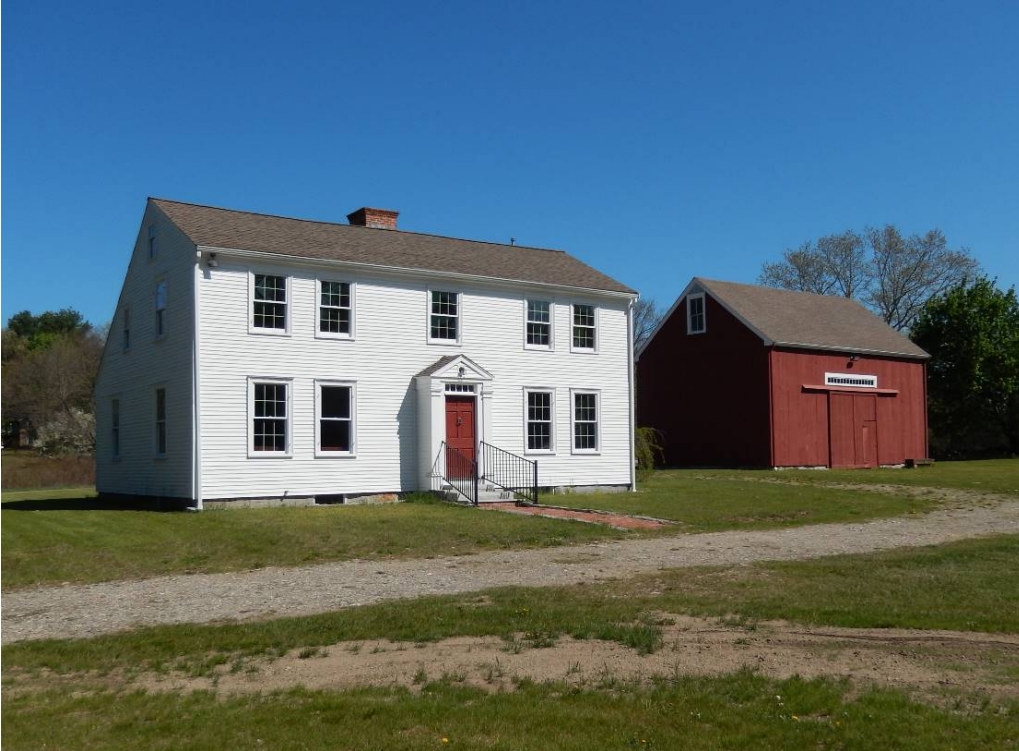
Hill Jock House, CLM.11 and Fiske Barn, CLM.339, facing northeast. May 2016.