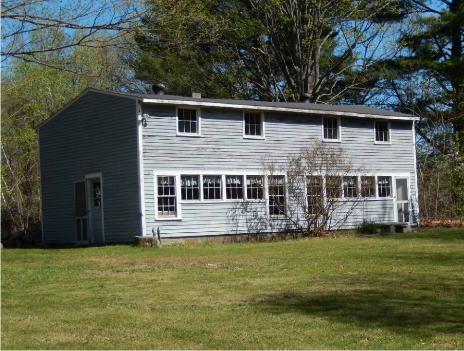
Craft House, CLM.338, facing northeast. May 2016.