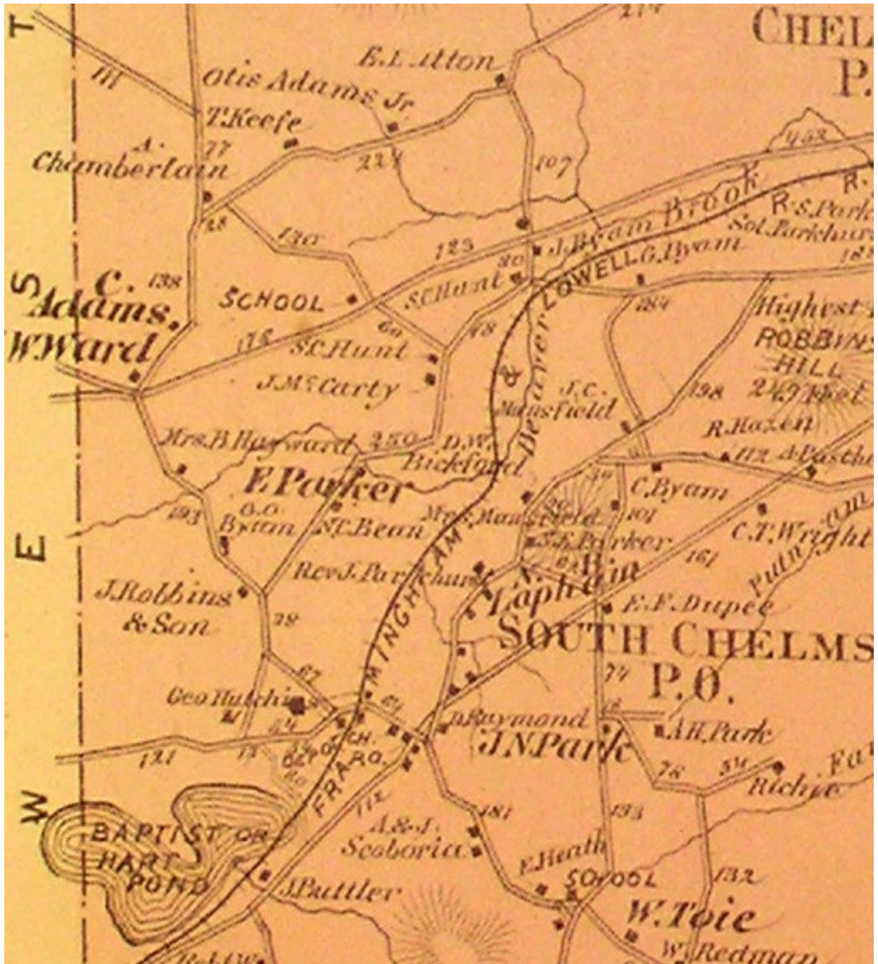
Beers' Atlas 1875