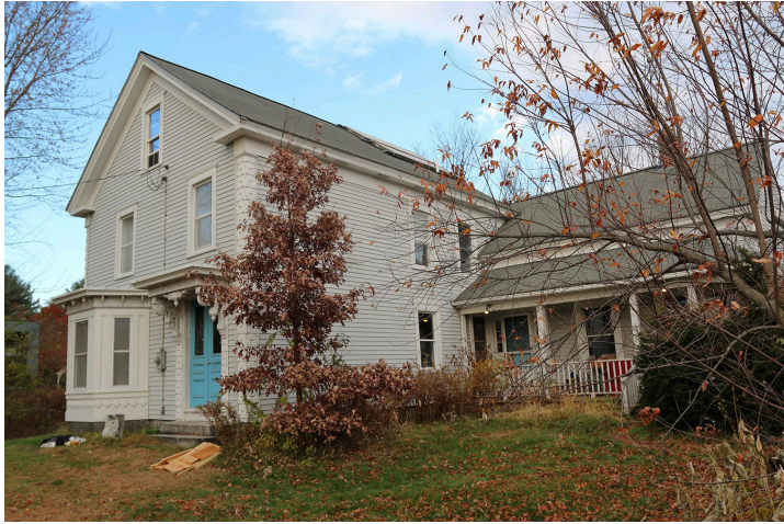
Photograph dated November 5, 2015