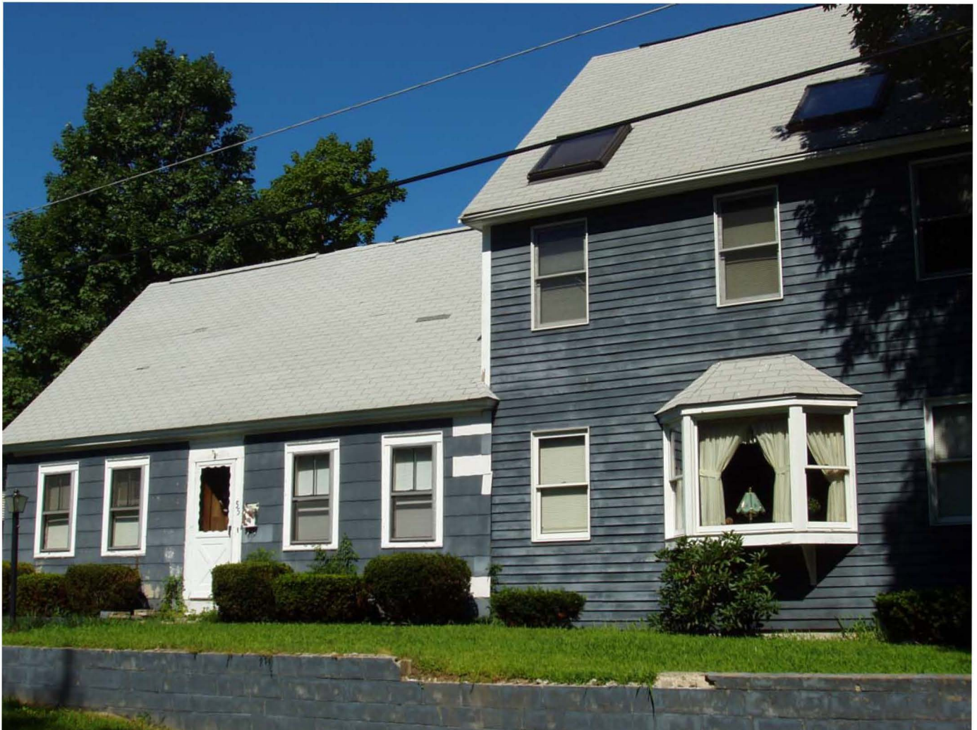
'Royal S Ripley House' 55 Gay Street