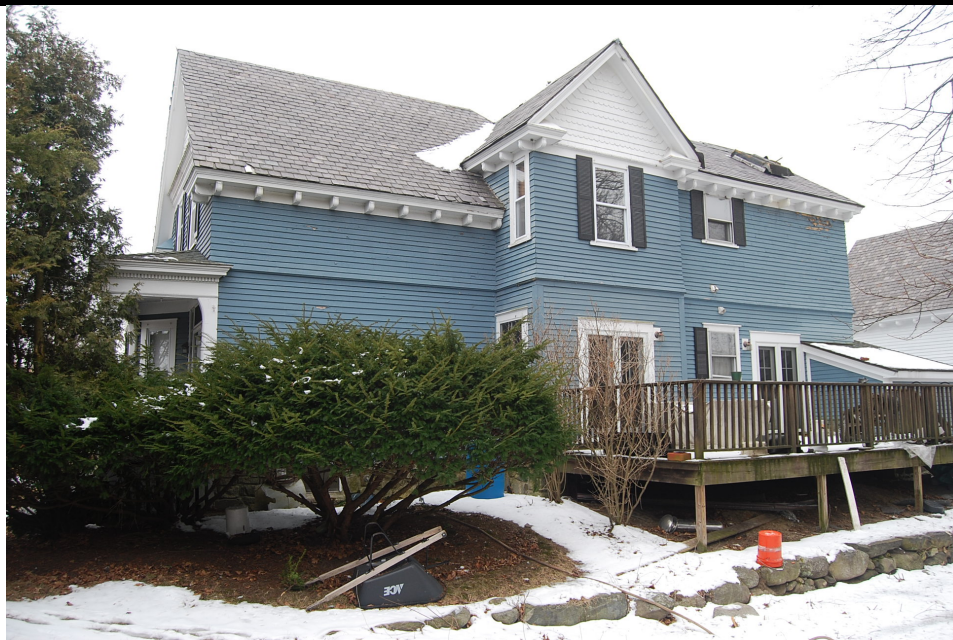
Photo 9. North elevation.