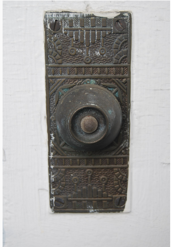
Photo 6. Detail. Doorbell.