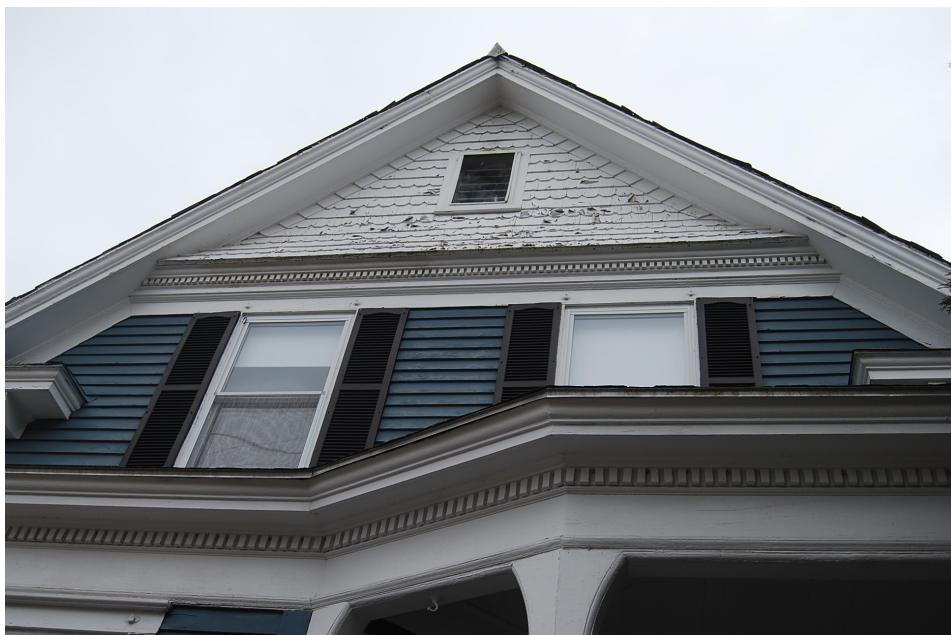
Photo 4. Detail. East façade.