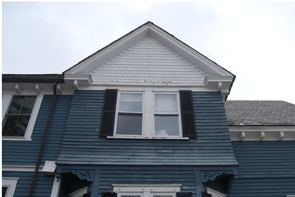
Photo 8. Detail. South elevation projection.