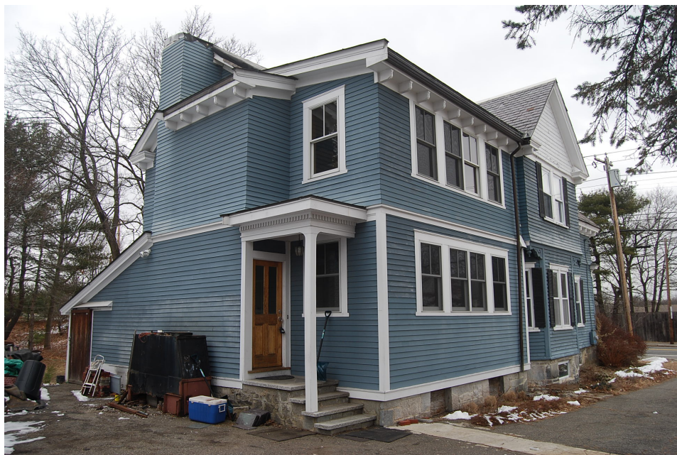
Photo 10. Recent addition at rear. West and south elevations. View looking northeast.