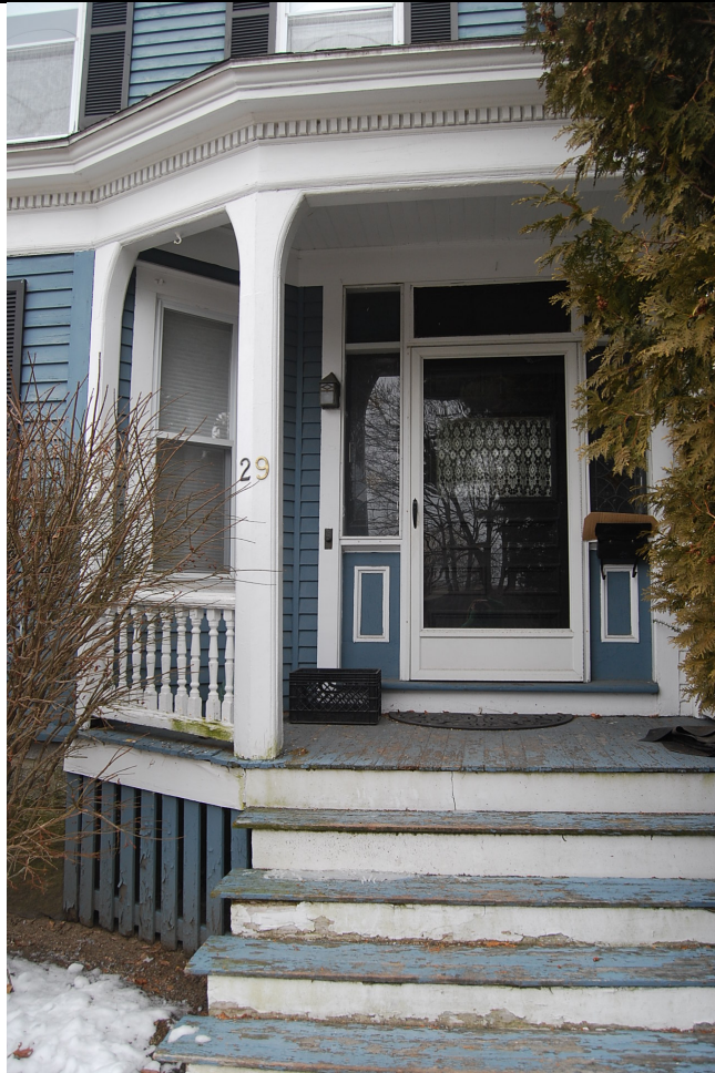
Photo 3. Detail. Porch.