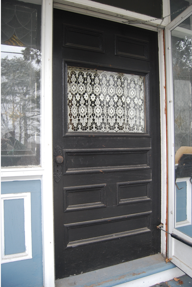
Photo 5. Detail. Door.