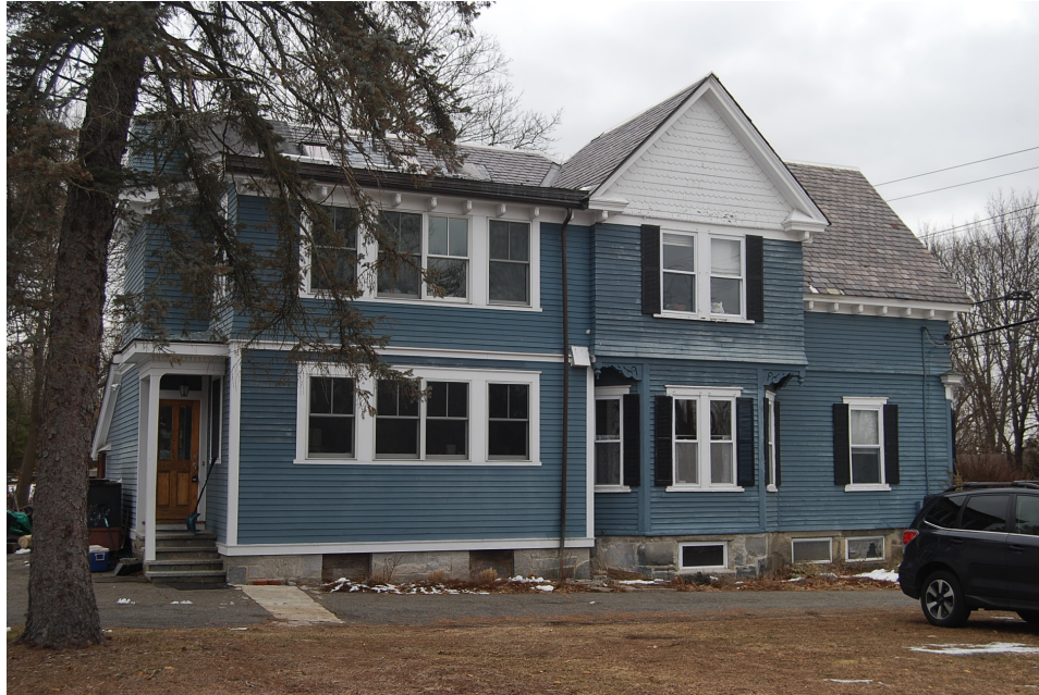
Photo 7. South elevation. Recent addition is located to left of cross-gabled projection and contains rows of four grouped windows.