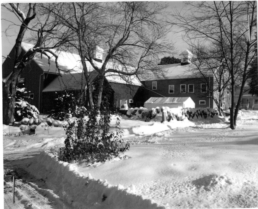
Southwest side of Barn #0390 Jan '08