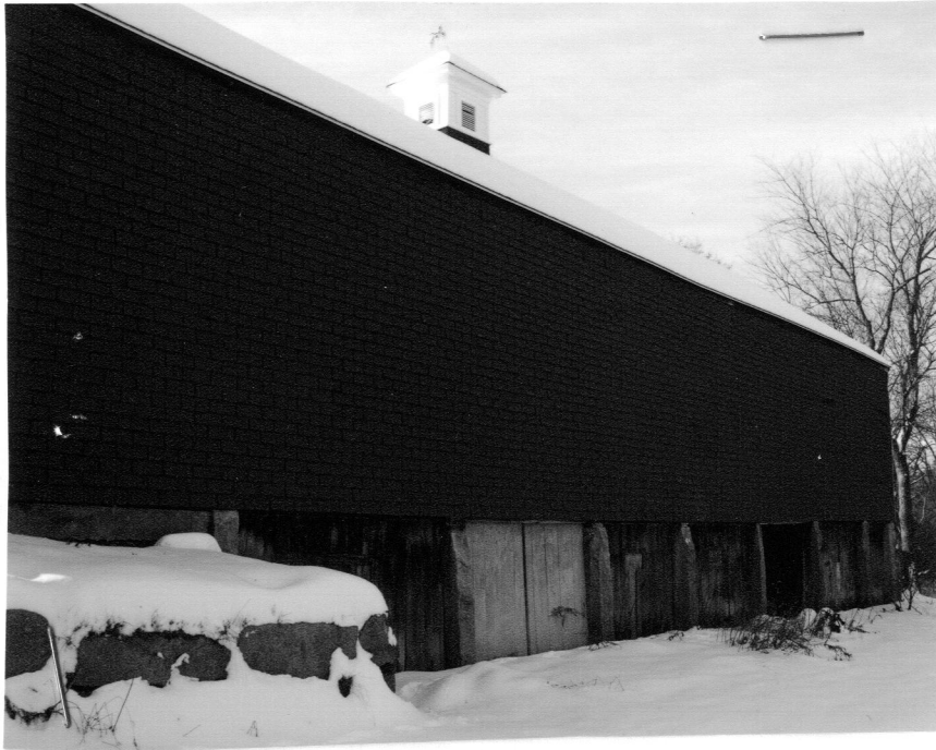
North side of Barn facing Graniteville Rd #0382 Jan '08