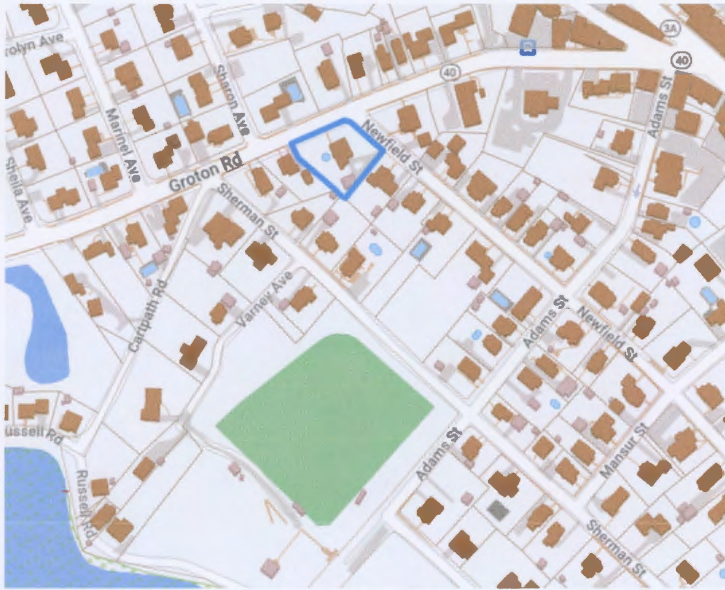
GIS Map, Chelmsford Assessors Office