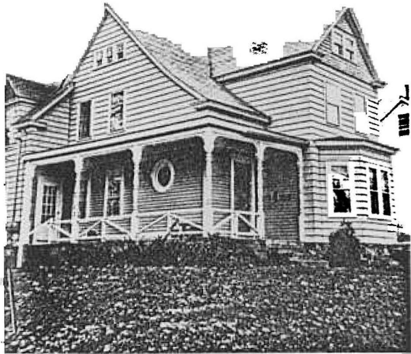
in relation to nearest cross streets and other buildings. Indicate north.