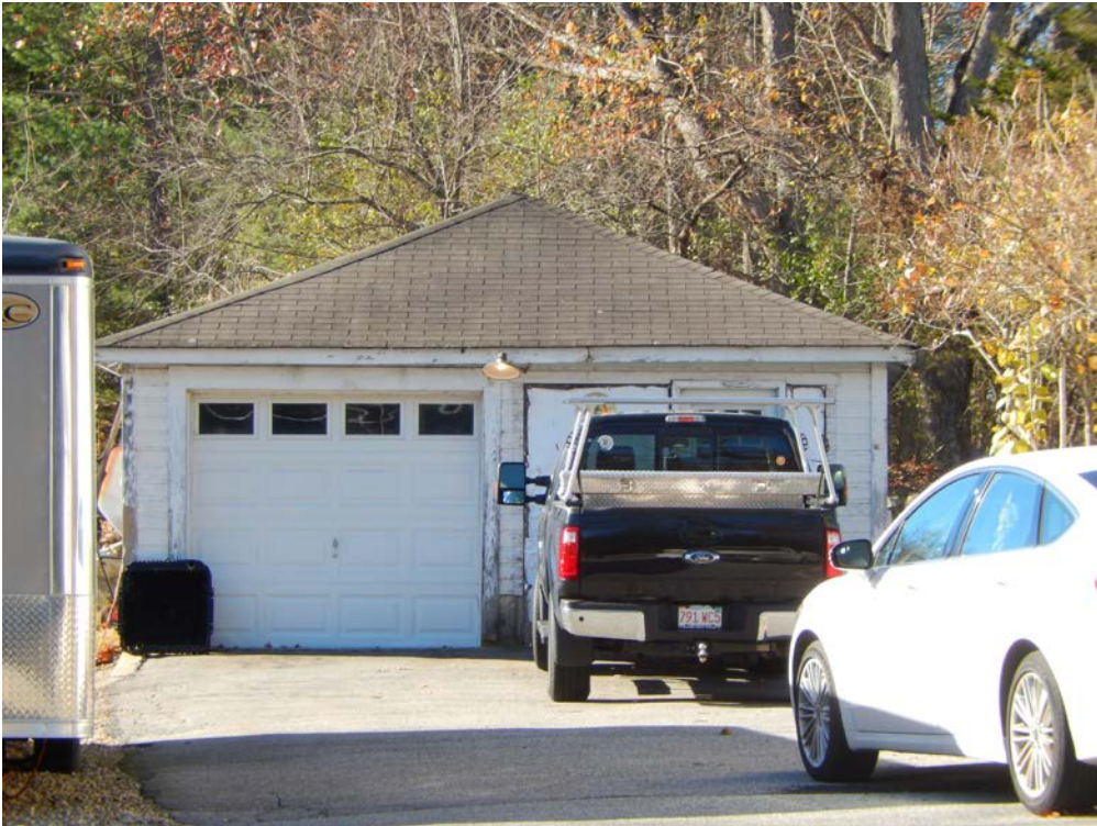
Garage at 157 Main Street, facing west. November 2015.