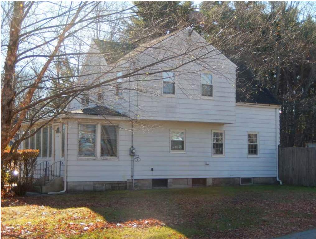
View of north wall of 163 Main Street, showing second story addition, facing south. November 2015.

Historic Aerial Maps. www.historicaerials.com .