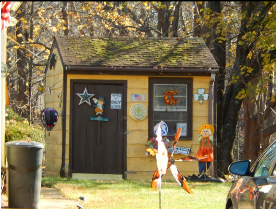
Garden shed at 182 Main Street, facing southeast. November 2015.