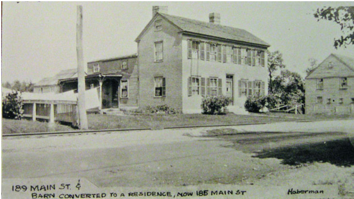
Postcard of 189 Main Street with 185 Main Street in the right background.

Middlesex North Registry of Deeds. www.lowelldeeds.com .