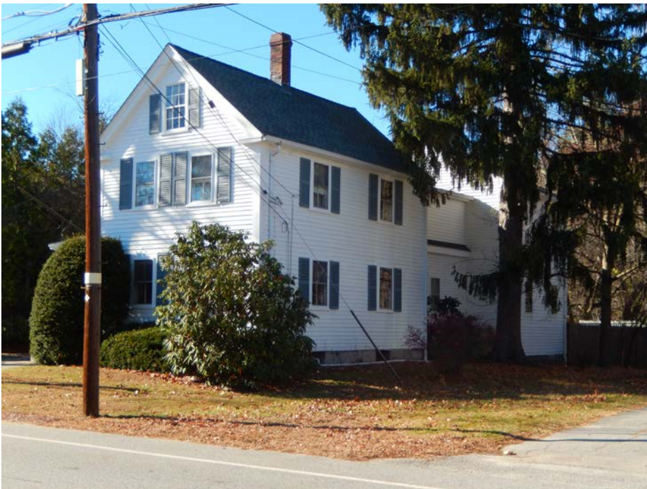
191 Main Street, facing southeast. November 2015.