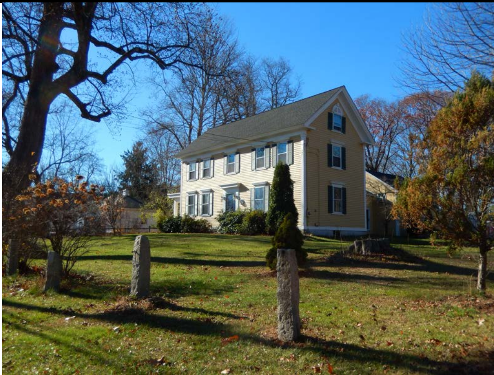
203 Main Street, facing southwest. November 2015.