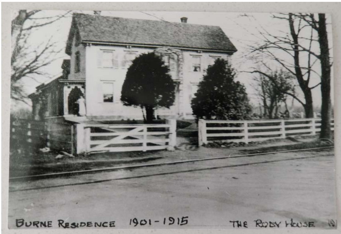
Early twentieth century photograph of 203 Main Street from Jane Drury Collection.