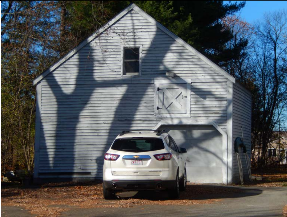
Carriage house, facing northwest. November 2015.