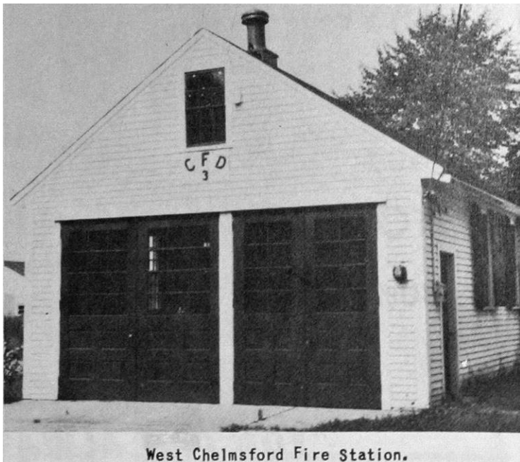
West Chelmsford Fire Station.