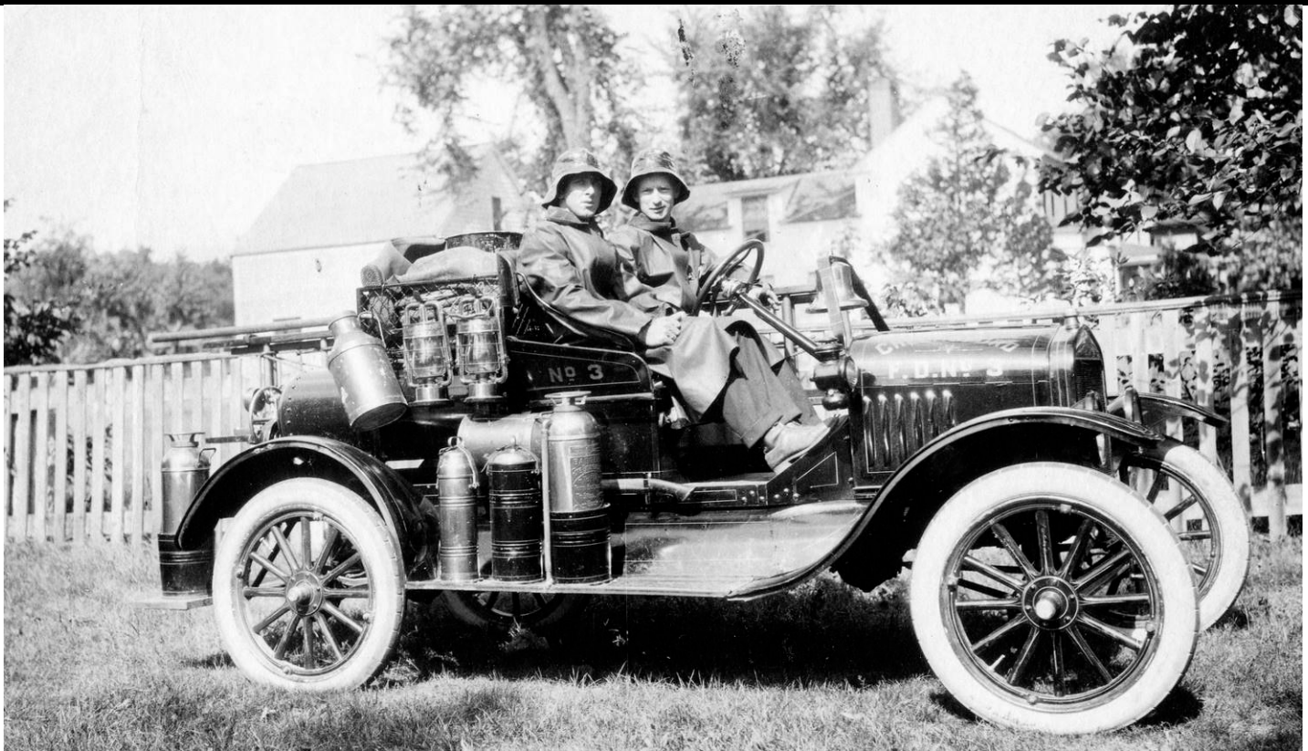
Undated photograph of the 1921 Ford Chemical Car No. 3 that was housed at 235 Main Street while in use as a firehouse.