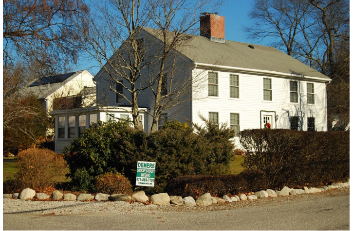
View looking northeast from Manning Road.