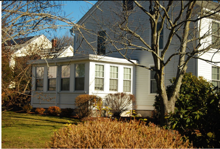
View looking northeast from Manning Road, west elevation.