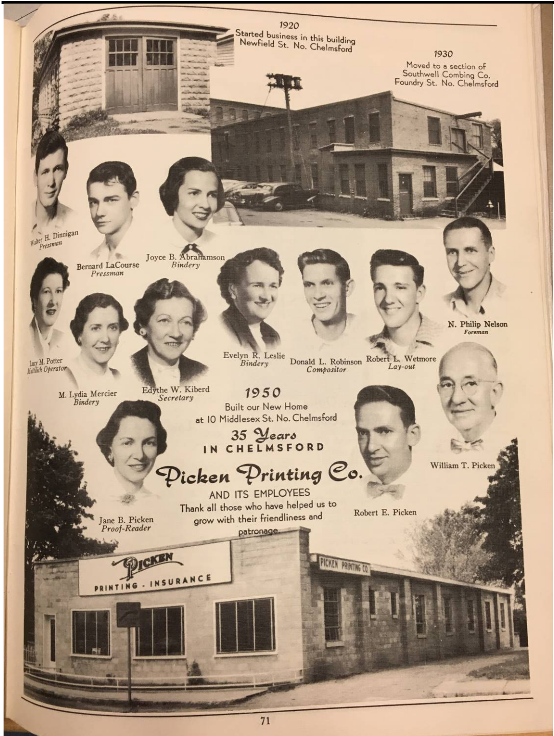
From the Official Tercentenary Souvenir Program 1655-1955, showing previous locations of the company and the building at 10 Middlesex Street, as constructed in 1950. Available at the Chelmsford Public Library.