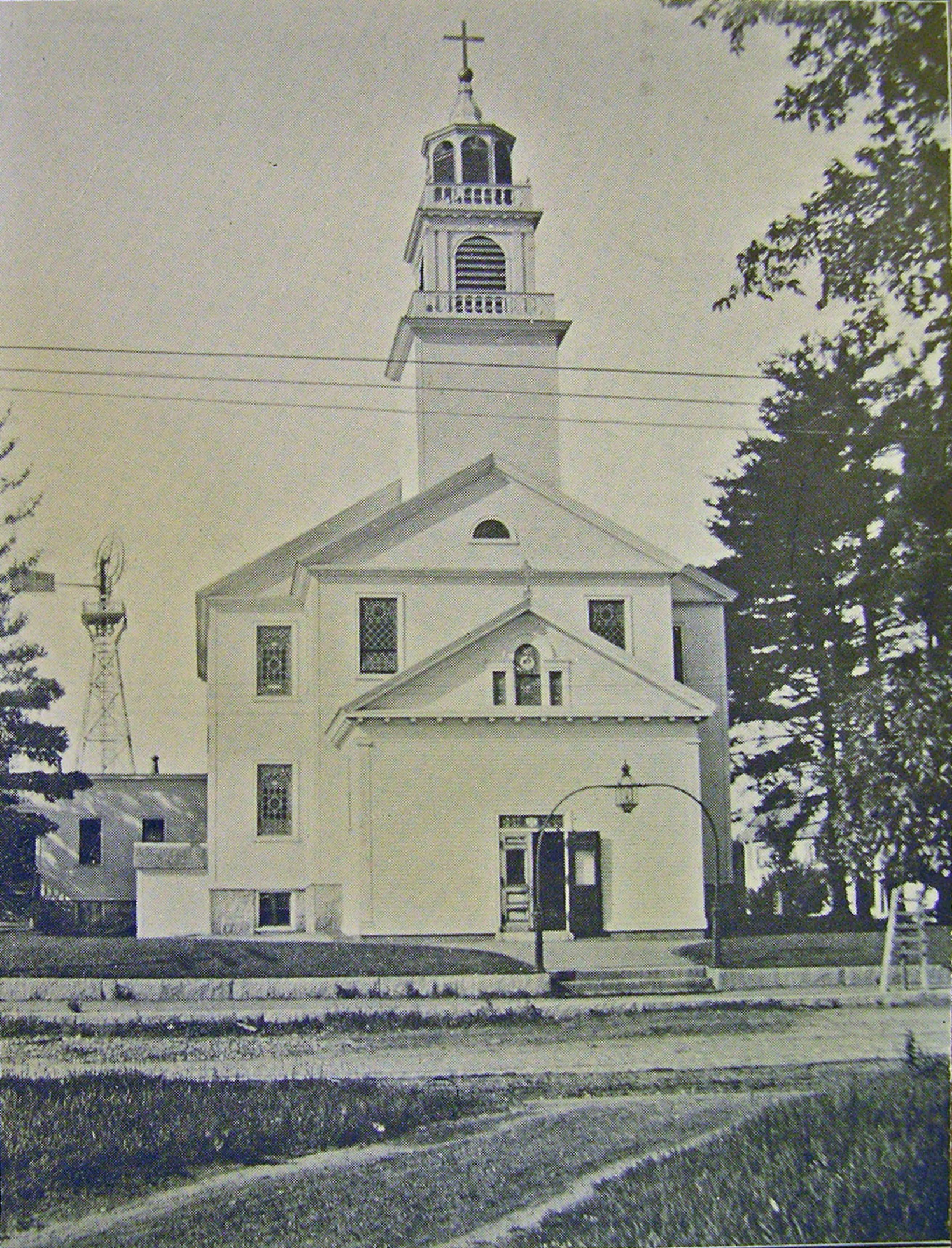
Saint John's North