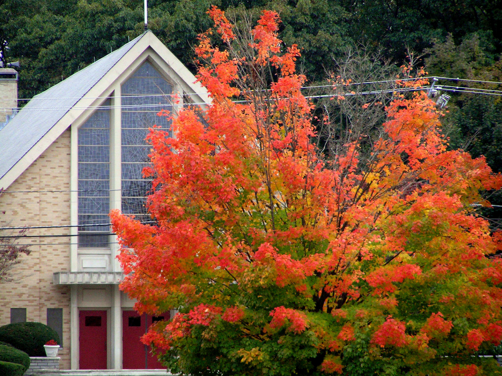
115 Middlesex Street - Saint John the Evangelist Parish