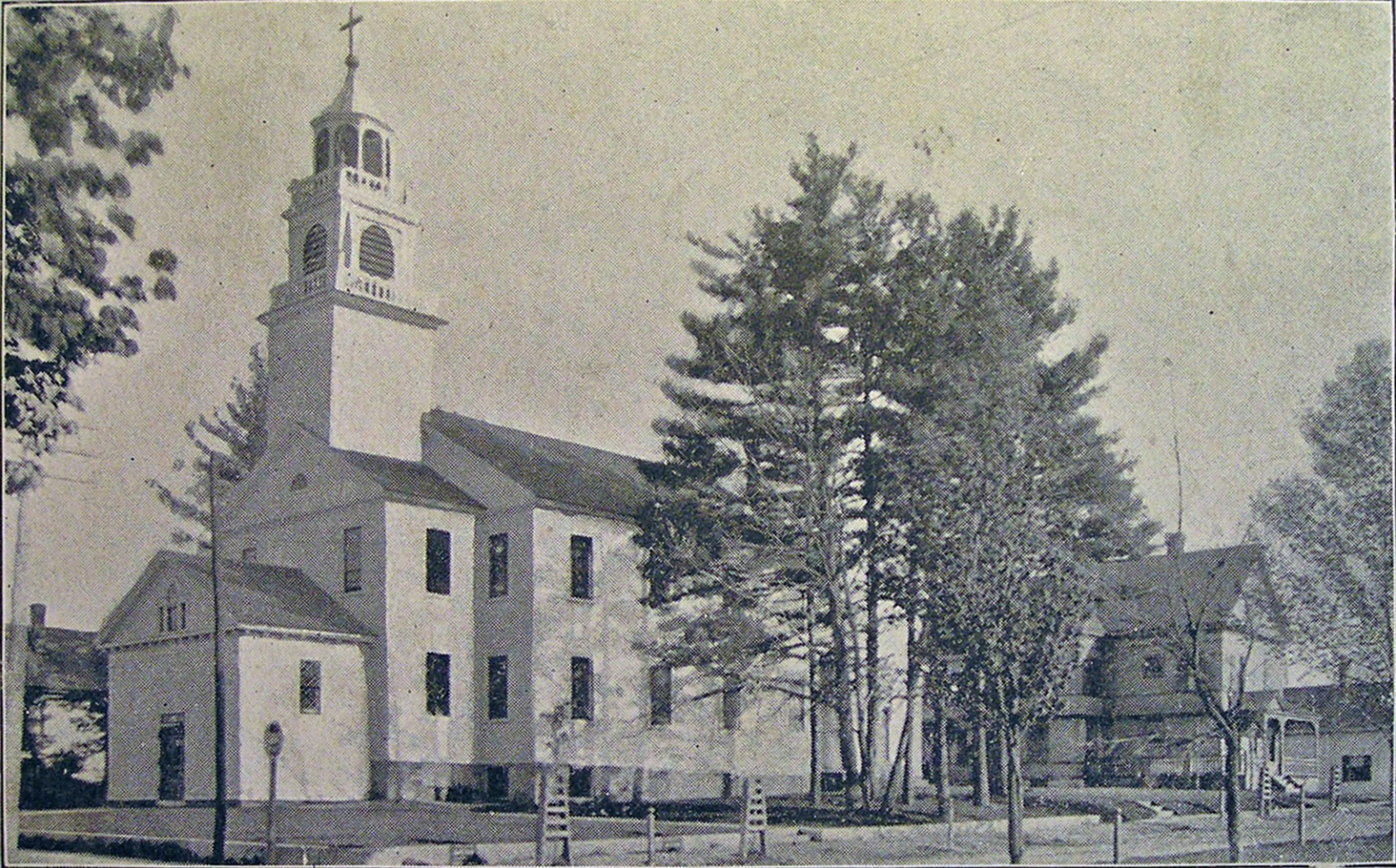
CATHOLIC CHURCH, NO. CHELMSFORD, MASS.