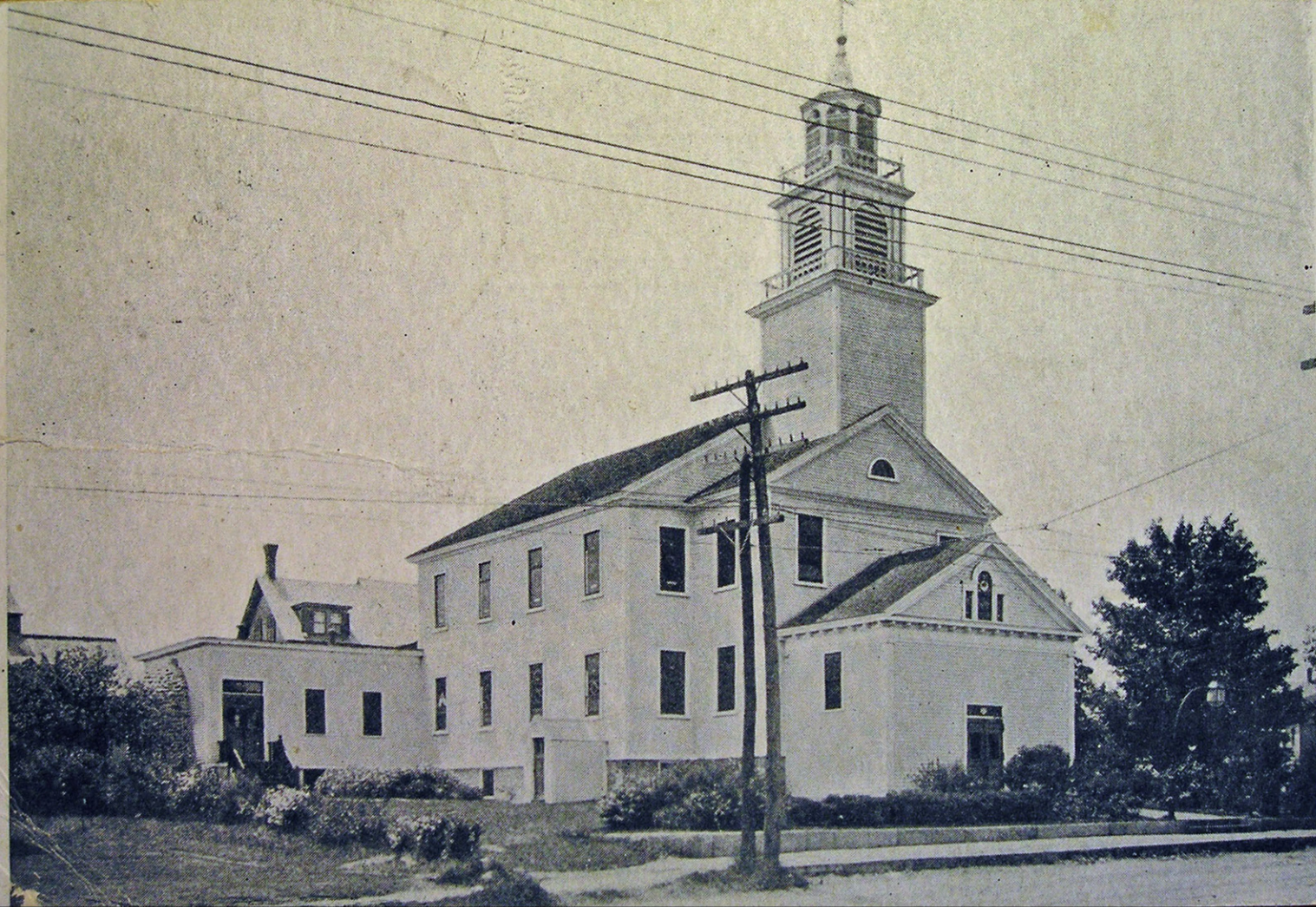
ST. JOHN'S CATHOLIC CHURCH, NORTH CHELMSFORD, MASS. 3284