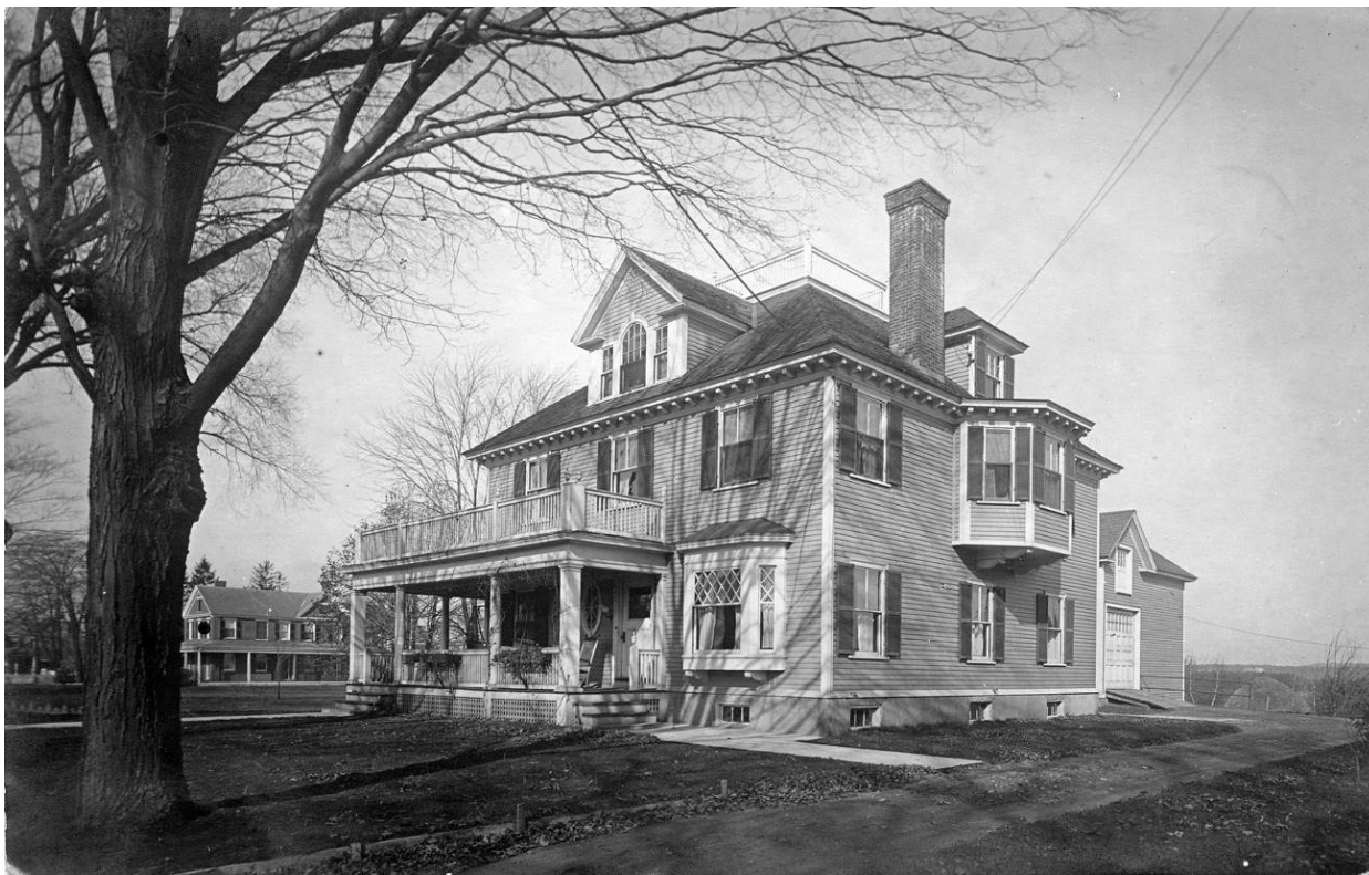
Undated photograph of 34 Middlesex Street.