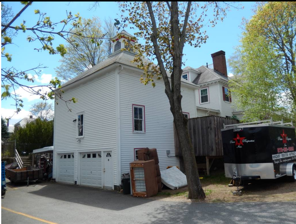
Converted carriage house, facing southeast. May 2016.