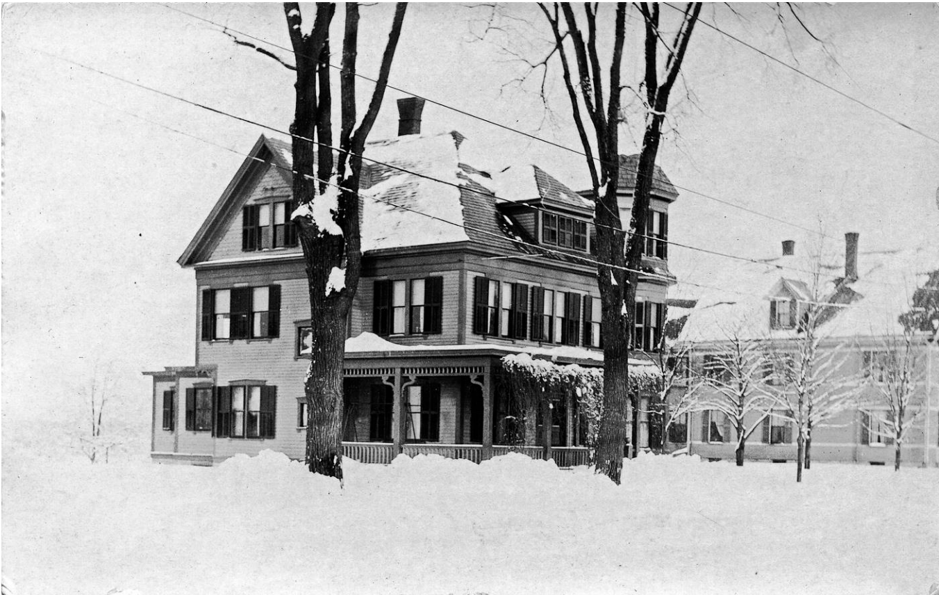
Undated photograph of 42 Middlesex Street.