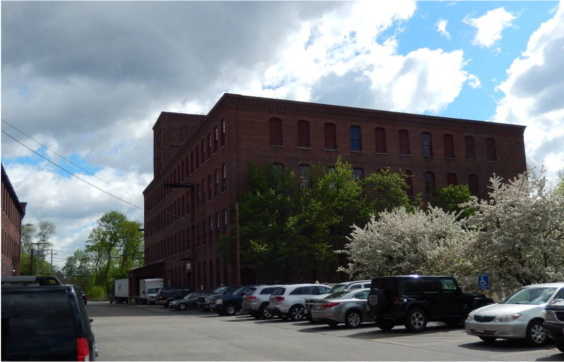
61 Middlesex Street, facing northeast. May 2016.