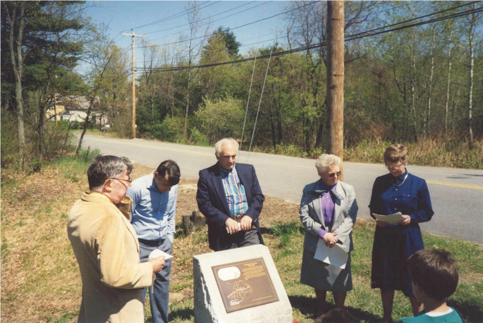
127 Riverneck Road, Middlesex Canal Monument 5/9/1991