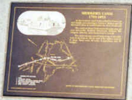
127 Riverneck Road, Middlesex Canal Monument 5/9/1991