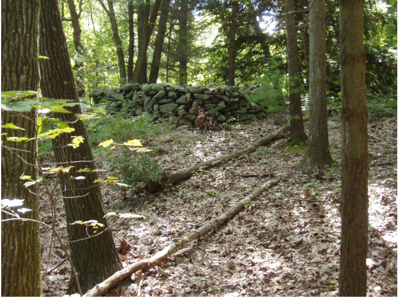
Robin Hill Road #10 'Parkhurst's Pulpit'