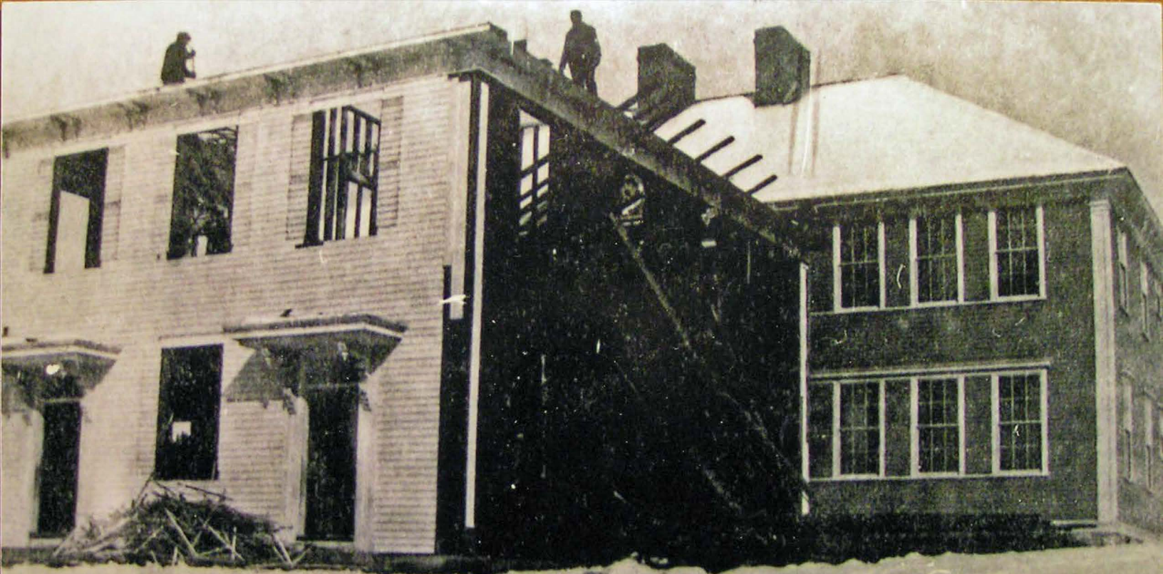
NEW WEST SCHOOL BUILT IN REAR OF OLD CIRCA 1904-5

Old West School being dismantled in 1905, and new West School under construction behind it. The new school was named after Corporal George R. Quessy in 1922