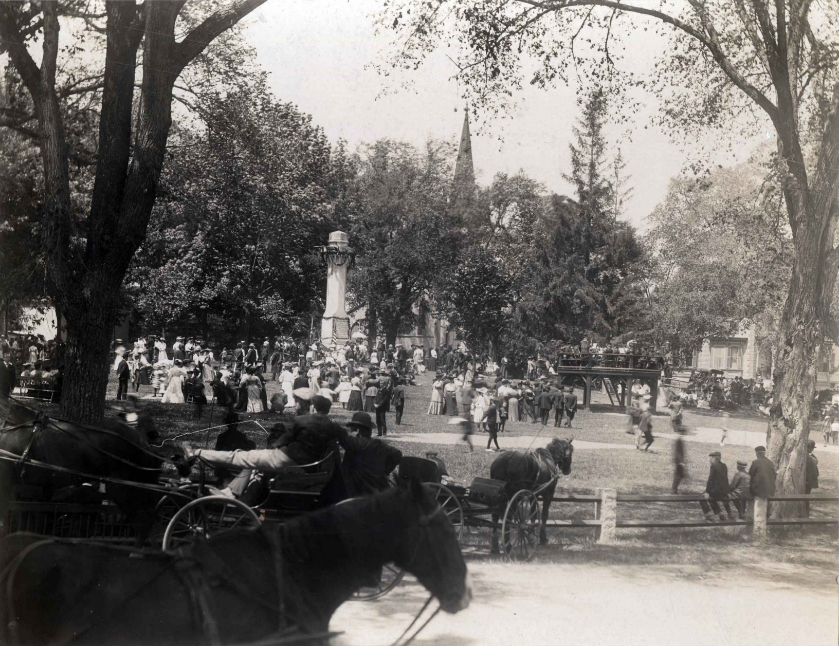
250 Anniversary Celebration, 1905