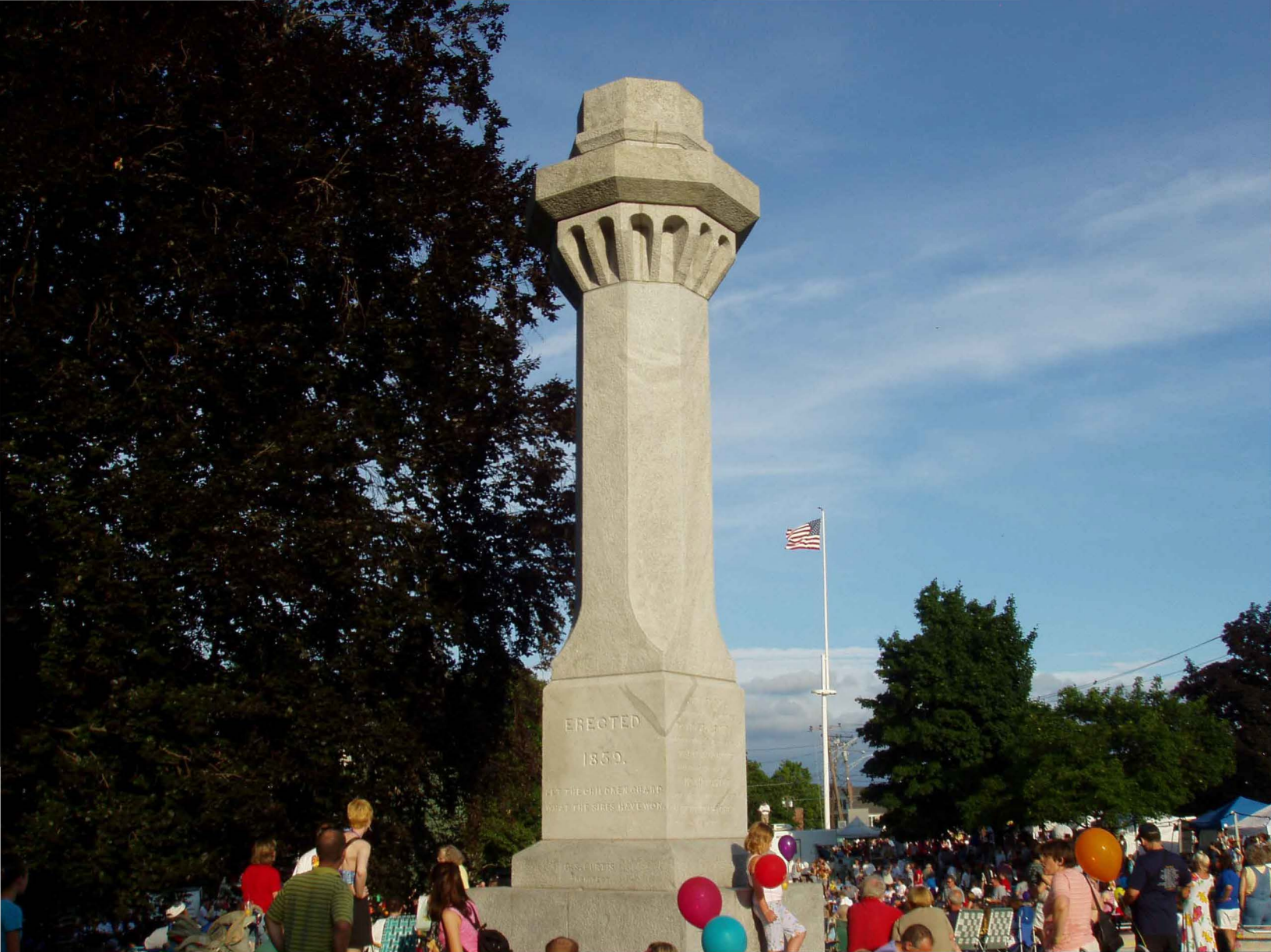
Revolutionary Monument July 3, 2003 F. Merriam