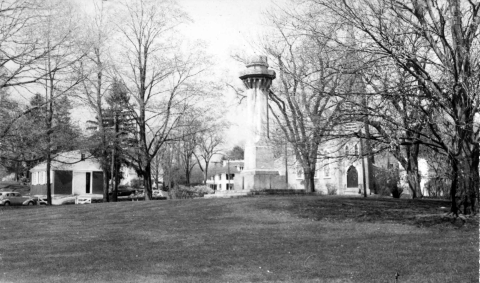
Revolutionary Monument 1955