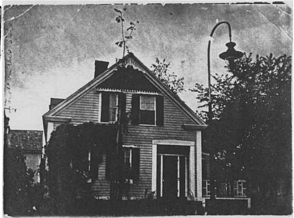
1936 oldest picture