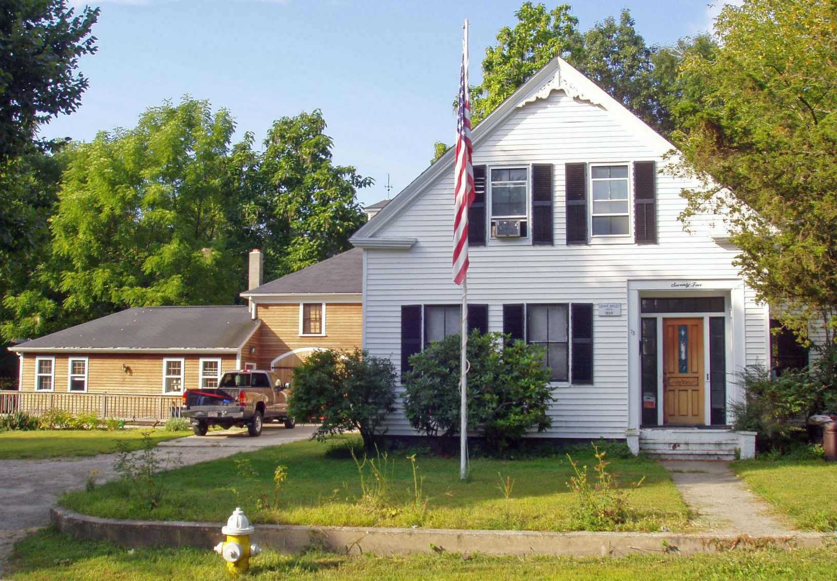
75 Newfield Street