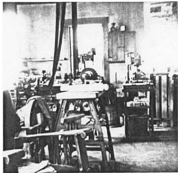
Inside of Garage