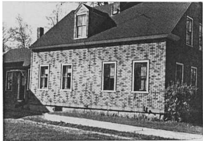
newest picture before 1969