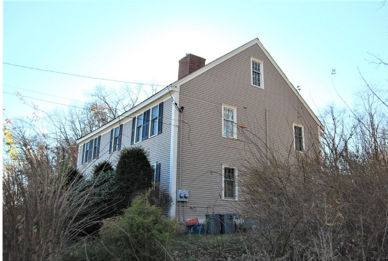
View looking south at east (façade) and north elevations from North Road.