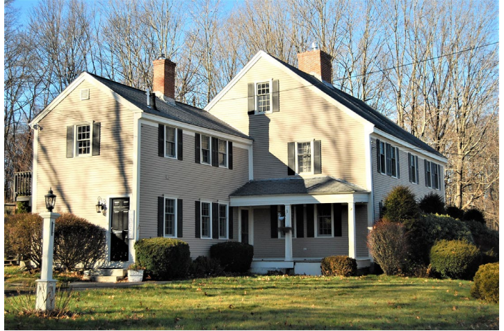
View looking north from North Road.