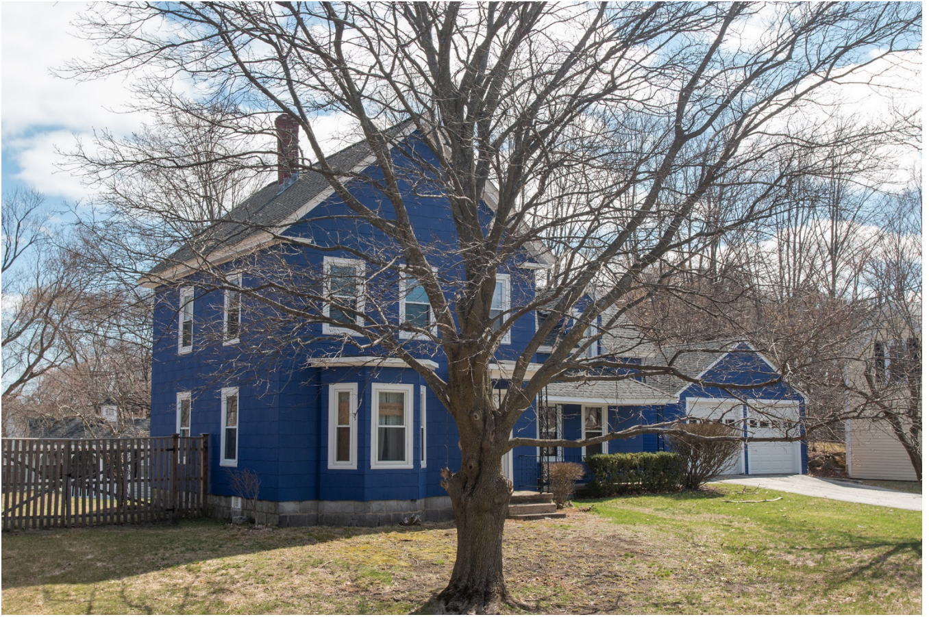
47 North Road, 2 April 2021, by Fred Merriam